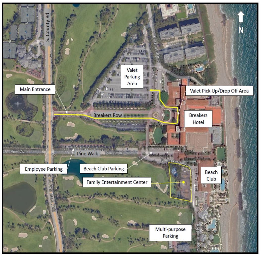
Existing PUD Master Plan