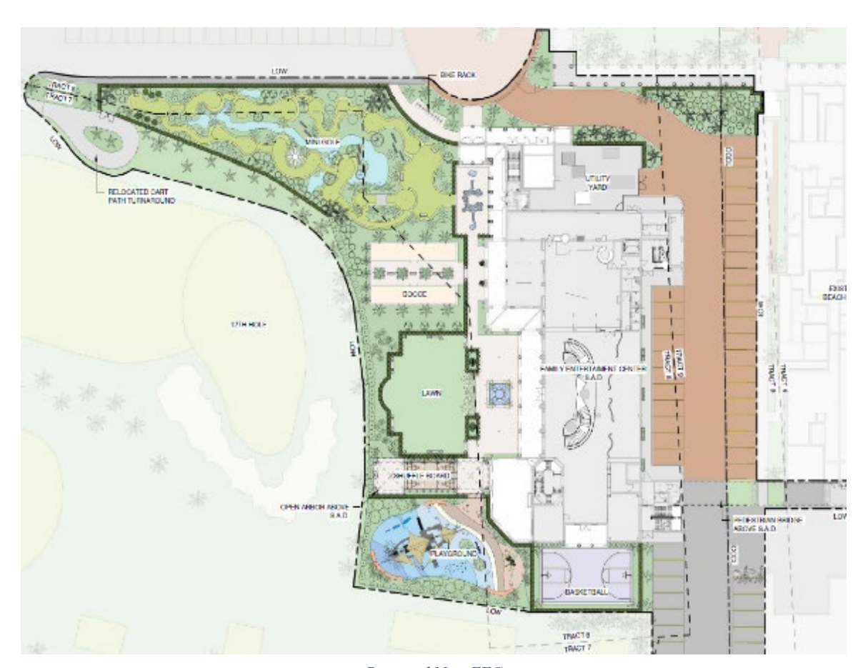
Proposed New FEC

(a) In a planned unit development, landscape treatment for plazas, roads, paths, service and parking areas shall be designed as an integral part of a coordinated landscape design for the entire project area. As shown below, with the new FEC, the existing parking lot will be replaced with enhanced landscape treatment, an outdoor recreational area and elevated pedestrian connection to the Beach Club.