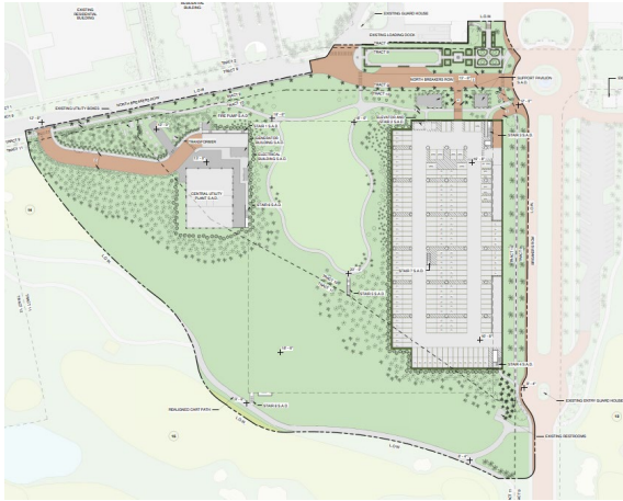
Existing Surface Parking of Central Park