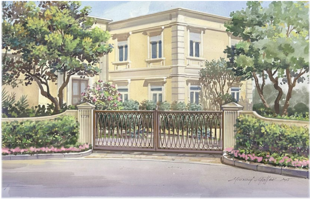
PROPOSED FRONT GATE PERSPECTIVE