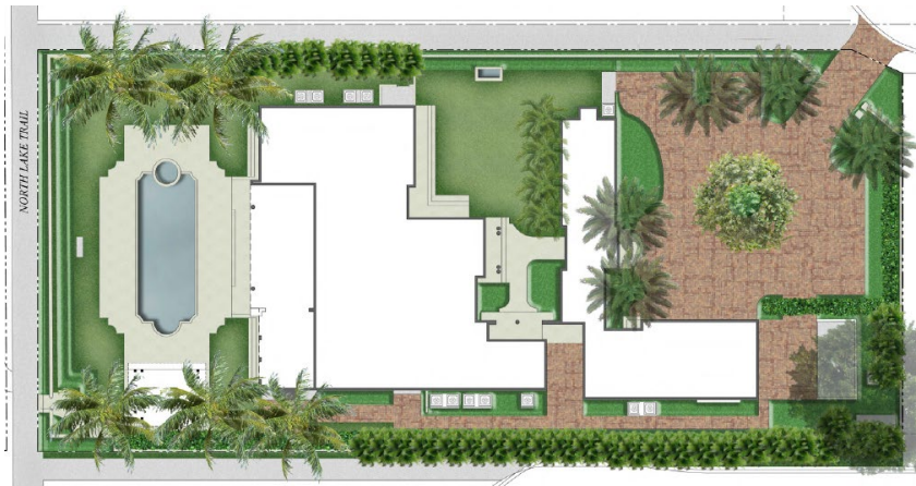
PROPOSED SITE PLAN – APPROVED AT THE 9/25/24 ARCOM MEETING.

The subject property is a lakefront site that has access from Plantation Road and N Woods Road. Two pedestrian passages access the east-west way to the Lake Trail. The application for the addition of a new 7'-0" high site wall and landscape along the property line was approved at the September ARCOM meeting; however, the Commission requested that rear pergola structure be re-studied and return.