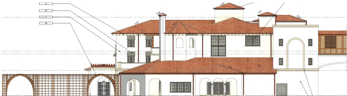
Proposed North Elevation