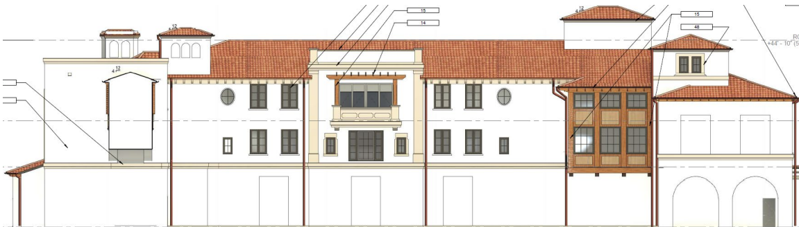
Proposed East Elevation