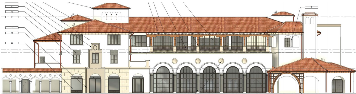
Proposed West Elevation

finishes are proposed to match the hotel and other buildings on site, roof is proposed in clay barrel tile with rafters proposed in wood or stone. Mechanical equipment is proposed to be screened on the rooftop. The west elevation will include a continuous loggia with arched openings, connecting to a covered walk at the northern end of the site, providing cover from guests as they move between the new structure and the hotel or Beach Club. A pedestrian bridge is proposed to connect the third floor to the upper floor of the beach club, over the private Breakers Row drive and parking area. The landscape incorporates enhanced outdoor recreation areas, shade structures, playground, and court games. Parking modifications are proposed without reducing existing parking capacity at the hotel.