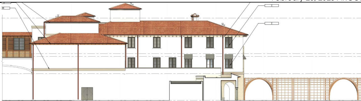
Proposed South Elevation

The plan calls for expanded entertainment options for children and families. A special exception is required for the outdoor court games being proposed, identified on the plan below with yellow highlight. The other outdoor entertainment areas are also called out for context.