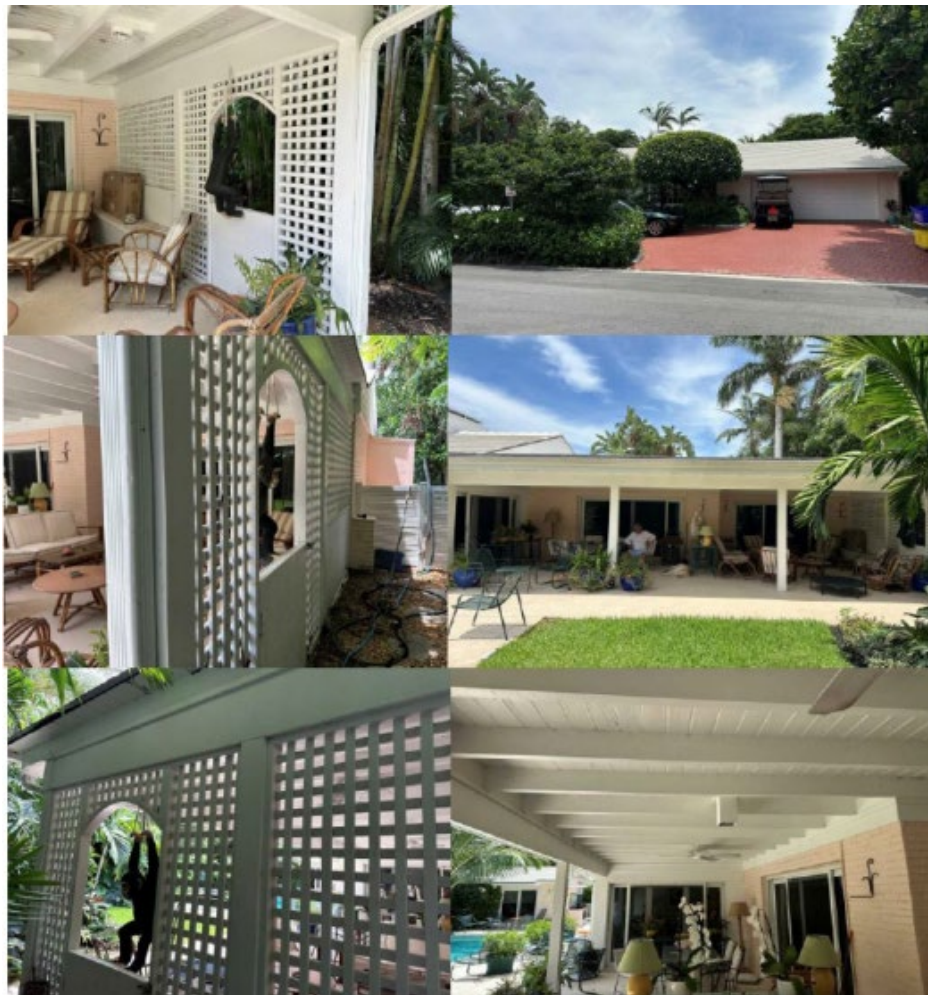
Photos depicting covered patio to be rebuilt.

The applicant is proposing to reconstruct an existing wood frame terrace at the southeast corner of the structure facing the southeast corner of the lot. The existing one-story structure was built in 1951. This one story open air terrace has exposed wooden beams and wood lattice on the east side. The proposed terrace will replicate the existing in location and design. Due to the amount of demolition required because of wood decay this proposal requires the granting of one variance to accomplish the plan.