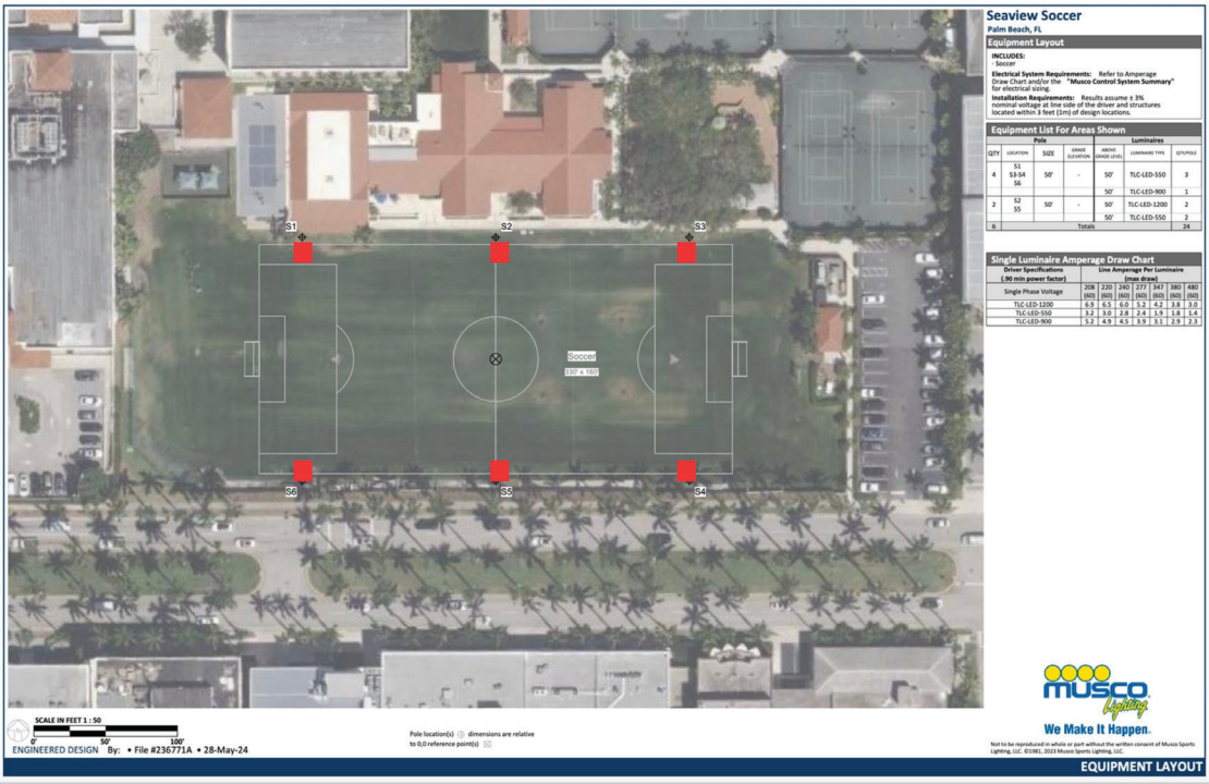
Locations of proposed lights