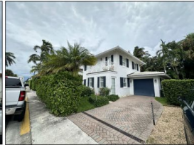
B) southeast corner looking northwest