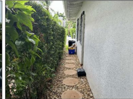
C) northeast corner looking south