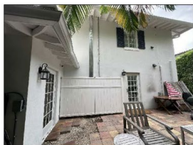
E) north property line looking south