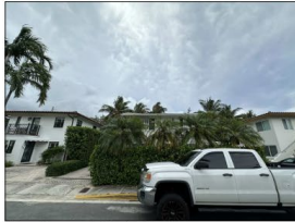
A) south property line looking north