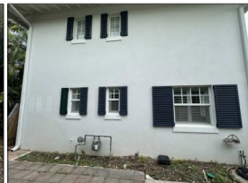
G) west property line looking east