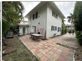
F) northwest corner looking southeast