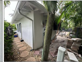
D) northeast corner looking southwest