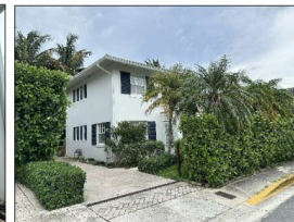
H) southwest corner looking northeast