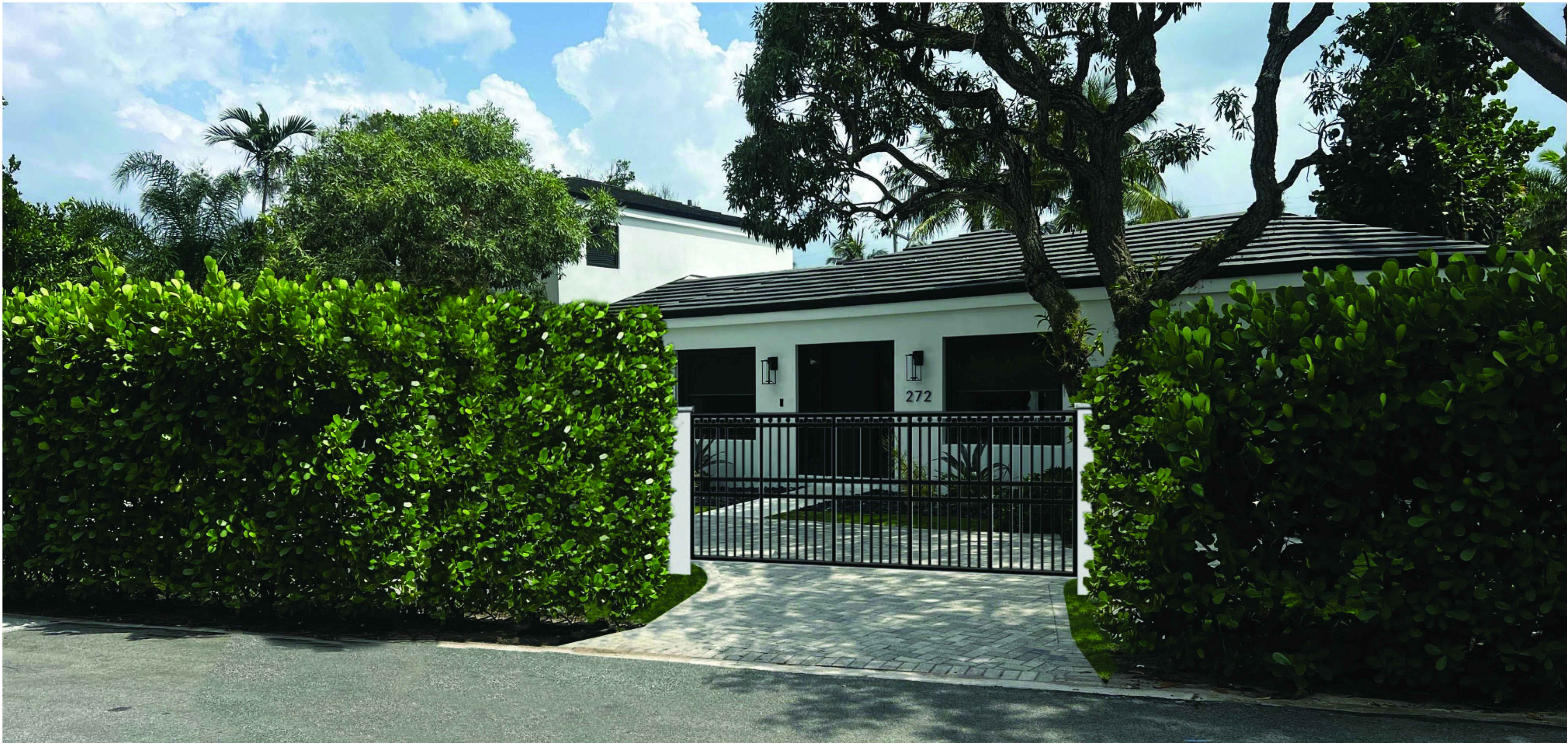
View to Proposed Gate