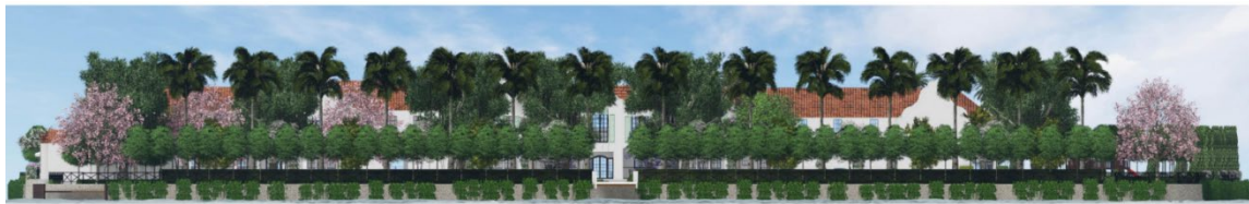
FRONT YARD ELEVATION EXTERIOR (NORTH)