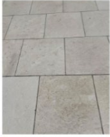
Material: Porcelain Tile Size: 24" x 24" (144 SF) To Match Existing Color: To Match Existing

Two (2) new fence types are proposed. Glass fencing surrounding the pool and black aluminum fencing along the perimeter of Tarpon Island. The black aluminum fencing will have a height of 4'-8" and feature a post finial and a crisscross design inspired by a historical photo of the property. New retaining walls are also proposed surfaced with oolite.