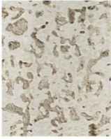
Material: Oolite Size: 24" x 6" Wall (128 SF), 12" x 6" Wall (128 SF)