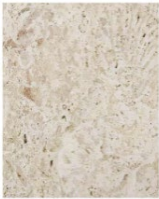
Material: Coral Stone Size: 8" x 16" (128 SF), 4" x 16" (64 SF) 16" x 16" (16 SF), 16" x 8" (32 SF)

Most of the existing hardscape will remain except for walkways on the south side of the property. The smaller historic pool, located on the east side of the property, will remain. In addition, the existing clay tennis court will be resurfaced with artificial turf. New hardscape surfaces include walkways and terraces that provide opportunities to view artwork. Extensions to the existing pool deck are also proposed. The surface materials are proposed to be coral stone and porcelain tile.