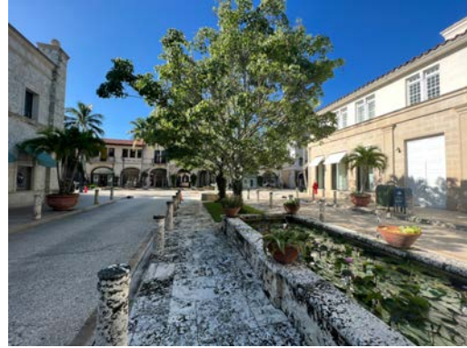
Left: Area of modification Right: No Changes to existing conditions on Hibiscus Ave. streetscape

Our proposal works with current conditions in a way that is both sympathetic of the original intent and respectful of the existing built conditions. Our focus is to replace the existing fountain stems and upper bowls only.