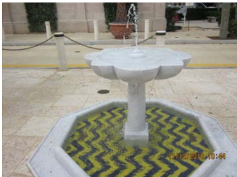
Original Design, Photo from 2010

I wish to express my support for the proposed modification of the two end fountains located at the intersections of Worth Avenue and Hibiscus Avenue. As the designer, I have approached this project with deep love for Palm Beach and respect for the highly visible location and the legacy of the existing square.