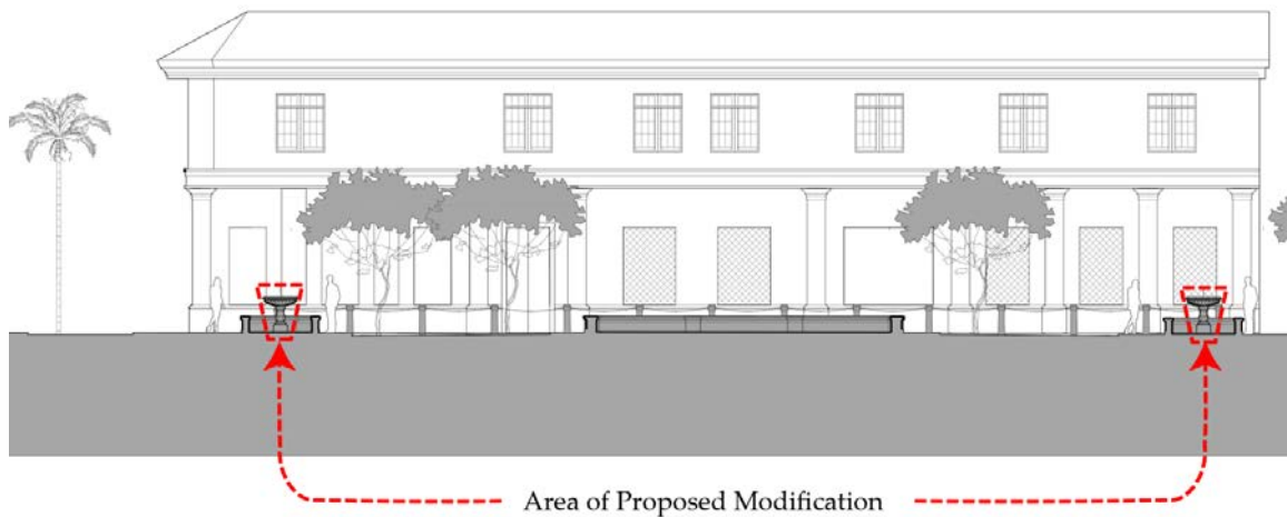
Section through Hibiscus Ave. streetscape showing proposed new fountain stems.

We appreciate your time and consideration and the opportunity to contribute to the ongoing beauty of Palm Beach.