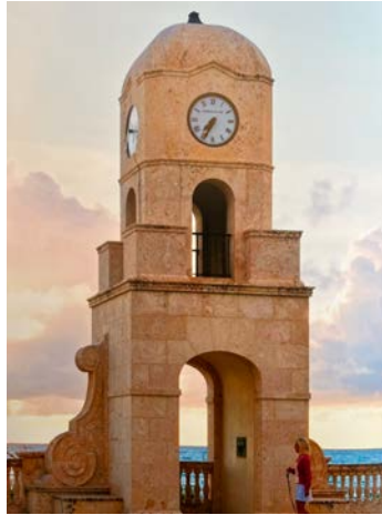
Palm Beach Clock, constructed of coral stone

The choice of materials and detailing for the fountains connects them to the iconic Worth Avenue clock tower. With the implementation of our design, the experience of strolling on Worth Avenue is punctuated by sculptural elements that relate to each other.