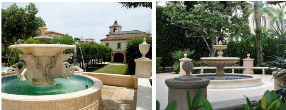
Left: Memorial Fountain constructed of cast stone, designed to imitate the color and texture of coral stone. Right: Earl E.T. Smith Fountain in natural hand-carved stone