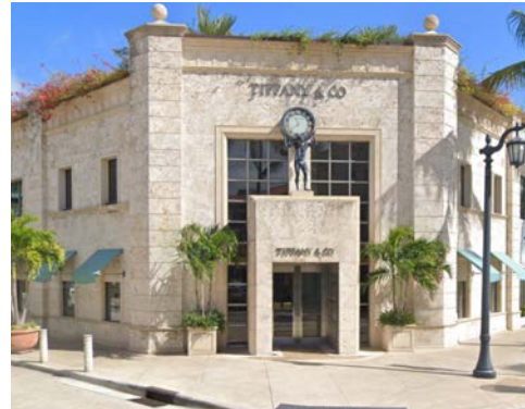
Left: Beige Cast Stone façade of Chanel on Worth Ave. Right: Coral limestone façade of Tiffany & Co. on Worth Ave.