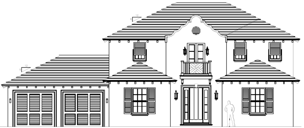
PROPOSED SECOND STORY SHUTTERS

Additionally, the existing driveway will be reconstructed using Dominican coral, bordered with tabby, while maintaining the current layout. The pool deck will undergo minor adjustments and will also be upgraded to Dominican coral. On the west side of the property, the pool equipment and generator will be relocated to a dedicated equipment yard, fully enclosed, with coral flagstone stepping stones integrated throughout the surrounding area.