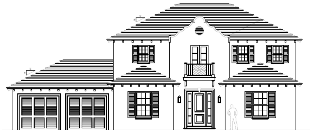
EXISTING SECOND STORY SHUTTERS

The applicant proposes updates to the exterior of the residence, including alterations to the shutters and front door at the front street facing façade. The second-story shutters will be replaced with Bahamian-style shutters, matching those currently in place on a select few of the first floor’s east and west elevations. All shutters will be repainted for a uniform appearance. Additionally, the existing solid painted front door with sidelights will be replaced with a natural wood entry door, enhancing the home’s façade.