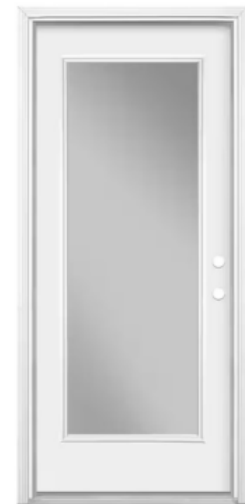
PGT Premium Aluminum Impact Exterior Door NOA: 23-0724.02 Expires: 10/18/2027

Portico Pitched Ceiling Tongue and Groove Painted White with recessed LED Lighting