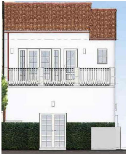
EXISTING SOUTH (REAR) ELEVATION