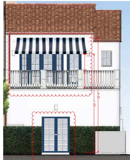
PROPOSED SOUTH (REAR) ELEVATION

The applicant is requesting the color change retroactively since the work has already been completed, as evidenced by the photo below: