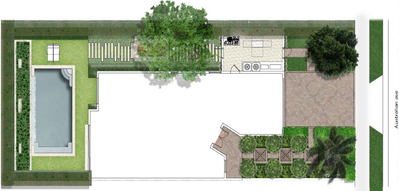
PROPOSED SITE PLAN RENDERING