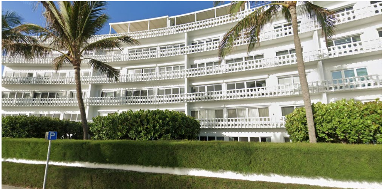
Google Streetview 2024

This large multifamily condominium building was built in 1960 and designed by Howard Chilton in the Art Moderne style. It has a semi-circular design and bold lattice like concrete balconies with a bold Porte cochere. The penthouse units have white awning canopies installed for shade.