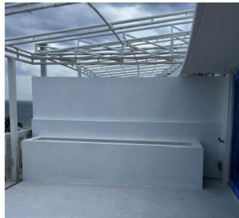
PROPOSED PHOTO ILLUSTRATION OF OWNER'S TERRACE PRIVACY WALL

There is concern though for the alignment of the walls in relationship with the vertical posts of the canopy supports. The proposed privacy walls are dimensioned at 2'2" and are neither in alignment with the posts nor spaced evenly between them. These walls also do not align with the vertical separators of the units on the floors below the penthouse. Therefore, a more aesthetically desirable approach from the street view might be to rebuild the planters at the height of the balcony railings and set in the walls from the balcony or revert back to a fabric separator for the vertical element.