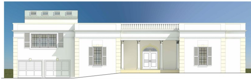
EXISTING EAST ELEVATION SCALE: 1/4" = 1'-0"