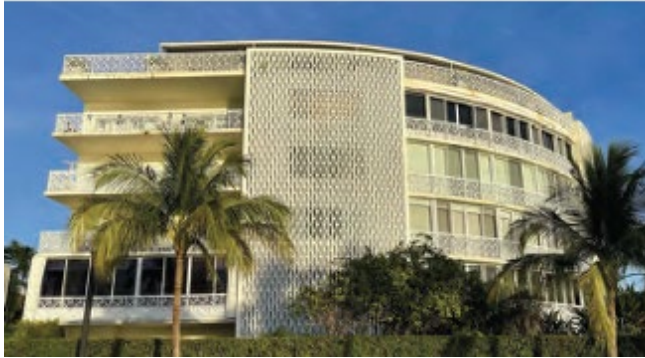
Previous (original) Conditions