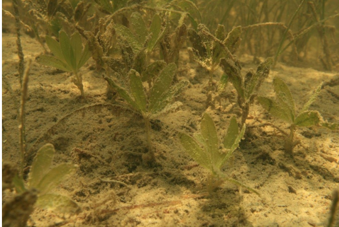
Johnson's Seagrass, Federally Threatened Species

Researchers believe that the majority of seagrass loss can be primarily attributed to reduced availability of light, which often coincides with blooms of phytoplankton. Intense blooms increase the amount of shading and result in the loss of seagrasses. Blooms occur in waters that have high concentrations of nutrients, particularly nitrogen and phosphorus, from