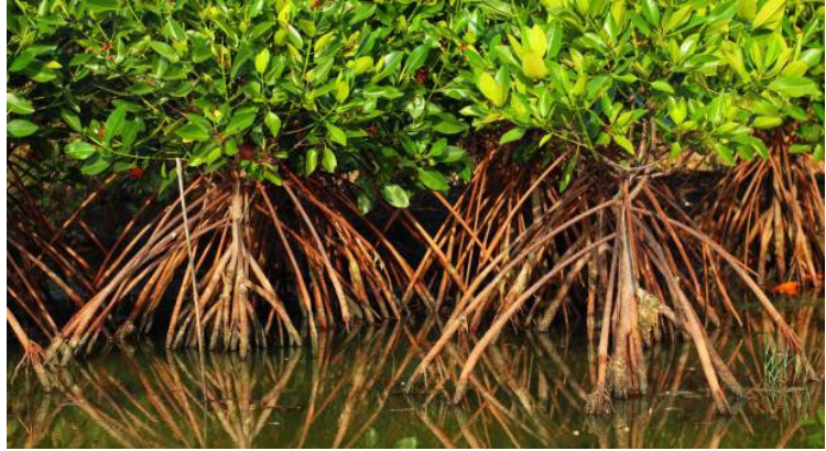
Red Mangrove Forest

A patchy series of nearshore and offshore reefs or rock outcrops lies parallel to the Town's Atlantic coastline. Offshore areas are subject to variability. Some nearshore areas can have a very limited diversity or density of species due to naturally high sedimentation rates and low rock relief. Others may support relatively rich populations of plant and animal life. As a rule, diversity and abundance of species increase with greater water depth and distance from the shore. However, site specific studies need to be conducted to determine the ecological value of any given offshore environment.