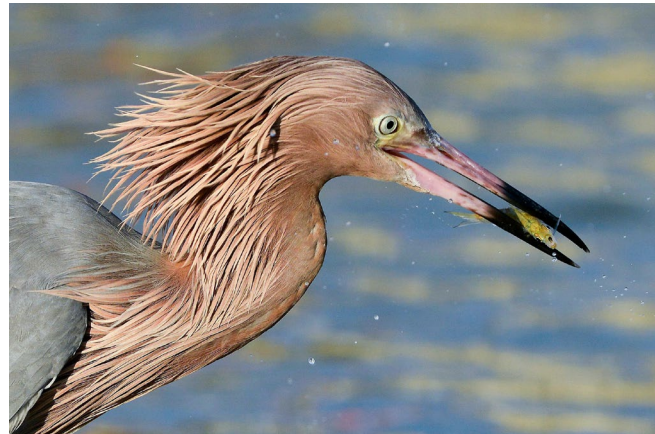
The Bingham Island

The Town's Code of Ordinances specifically speaks to the wildlife protection in Chapter 66, Article V. The Code recognizes that various species of animals found in the Town have been classified by the State Game and Freshwater Fish Commission as Endangered, Threatened, or Species of Special Concern, reflecting a depletion in population so critical that extinction is possible. As these species may be of aesthetic, ecological, educational, historical, recreational, economic or scientific value, the Town seeks to preserve a stable ecosystem, which is dependent upon the number and diversity of constituent species. The protection of these species requires preservation of occupied habitat, protective buffers and adequate management measures.