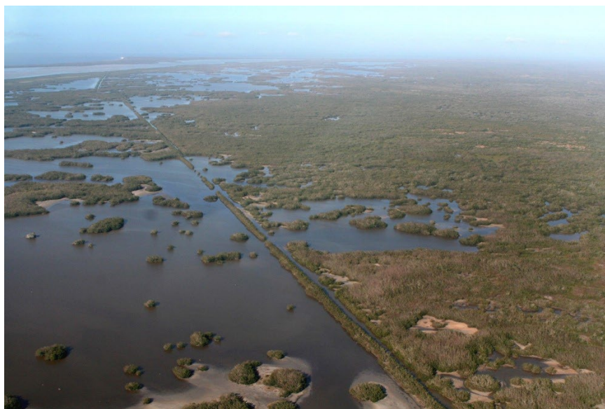
The Homestead Canal joining Lake Ingraham in the far distance. Everglades National Park

The draining of the Everglades in the 1930s began an era of rampant growth in Florida. By the 1950s, Florida's population had risen at an annual rate of approximately four (4) percent. Since then, more than eight (8) million acres of forest and wetland habitats (about 24% of the State) have been eliminated for development, thereby, threatening Florida's ecosystems. 3