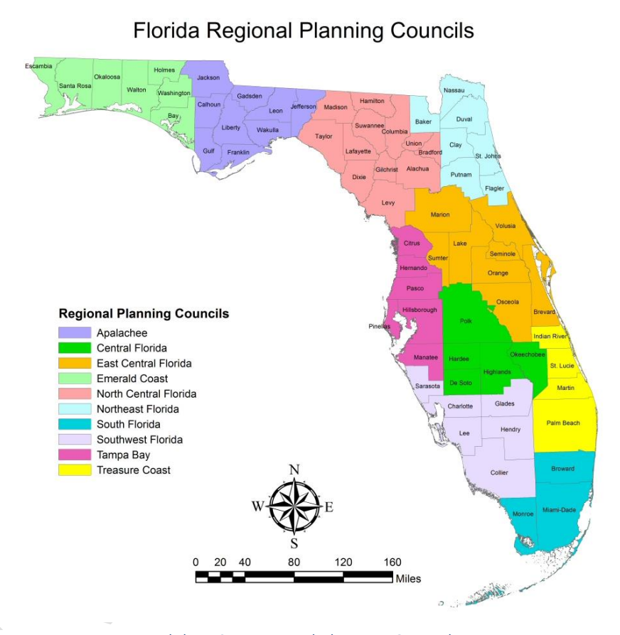
Exhibit 12-1 Regional Planning Councils

As noted in Exhibit 12-1, Treasure Coast Regional Planning Council (TCRPC) was established through an interlocal agreement between Indian River, St. Lucie, Martin, and Palm Beach counties. Membership includes all four counties and 52 municipalities.