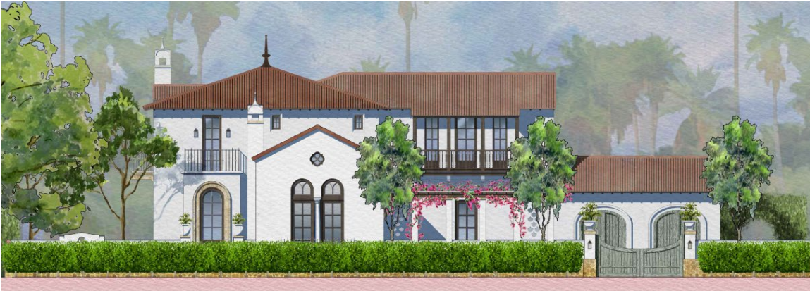
Front façade along Seaspray Avenue

The west side of the structure features a linear lawn in the north-south direction with direct access from a first-floor side door and from the first-floor partially enclosed rear loggia. A second-floor side projecting balcony is also proposed on the west side of the structure.