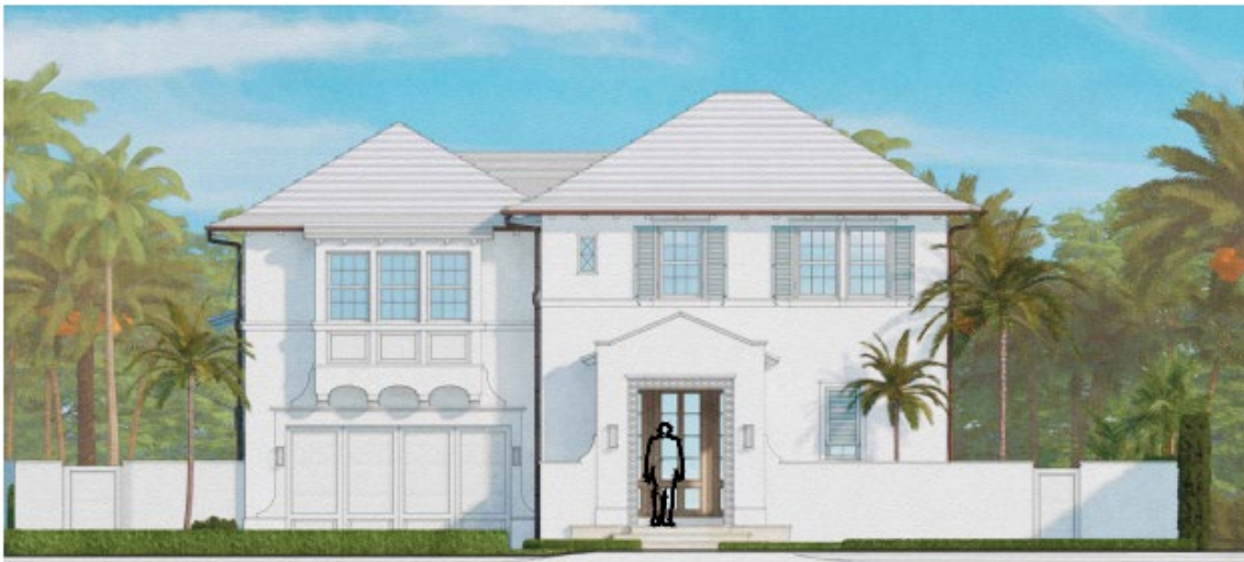
Previously proposed front elevation