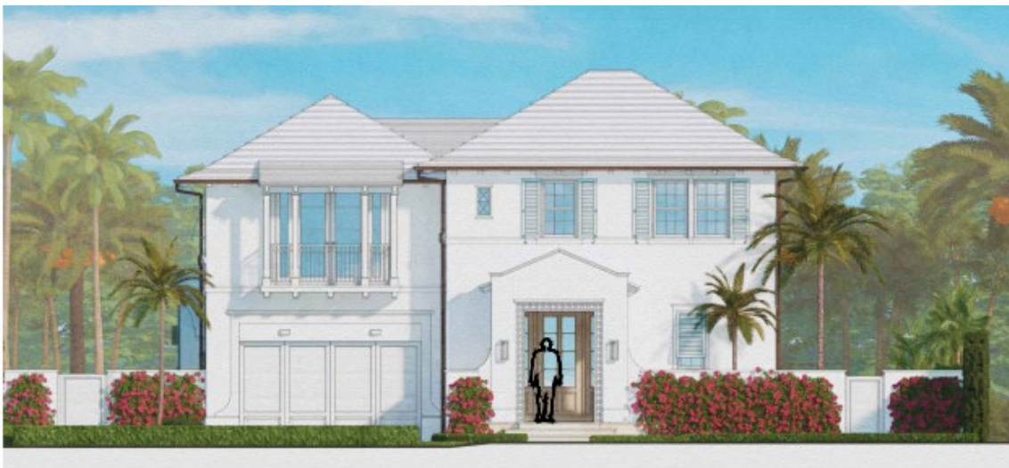
Currently proposed front elevation