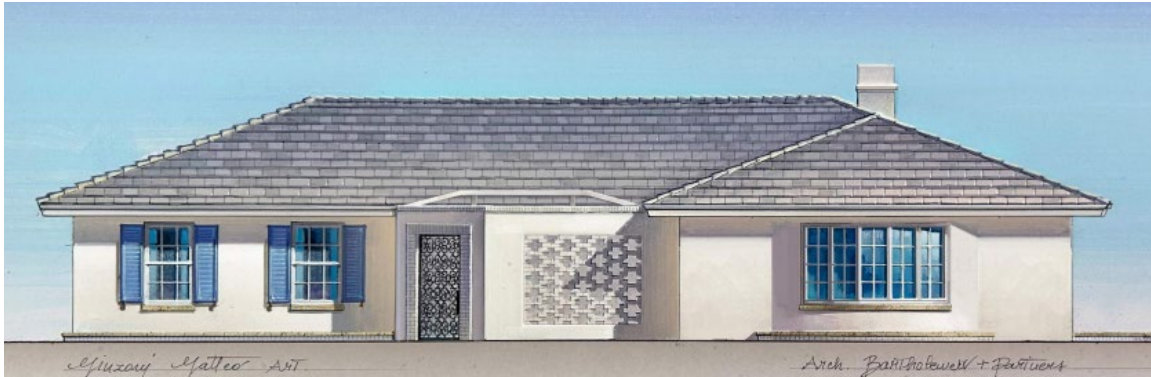
CURRENTLY PROPOSED FRONT ELEVATION

Additionally, the application involves the removal of a non-original screened porch and the interior conversions of an attached two-car garage into a new habitable area. A newly composed side terrace area is proposed accessed from the reconfigured living space. Additionally, the roof material will be changed to a white flat concrete roof tile.