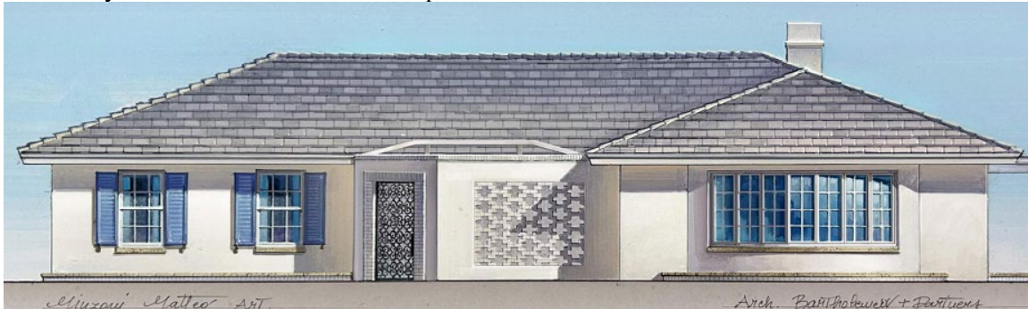
PREVIOUSLY PROPOSED FRONT ELEVATION

A review of the project indicates that the application, as proposed, appears to be inconsistent with the abovementioned sections of the Town zoning code. The application requests modifications to all façades including substantial window and door modifications to the modest one-story ranch residence and a change to the roofing material. The front (south), side (east), and rear (north) elevations are seeking considerable fenestration improvements to allow much more light into the residence through the incorporation of larger window openings, new doors, the removal of a large garage door panel, and the installation of fixed and operable french door systems. Along the front façade the alterations include the removal of a brick windowless wall and the introduction of a bowed bay window and curved outdoor planter.