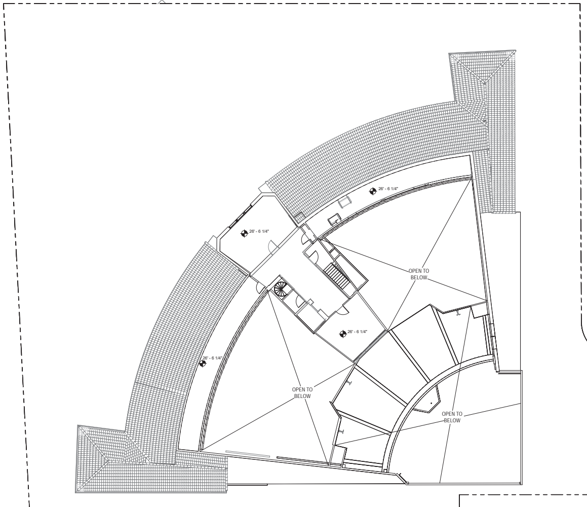
① EXISTING PLAN - LEVEL 03 3/32" = 1'-0"

Scale: 3/32" = 1'-0" Note: When printed on 11 x 17 paper scale is half