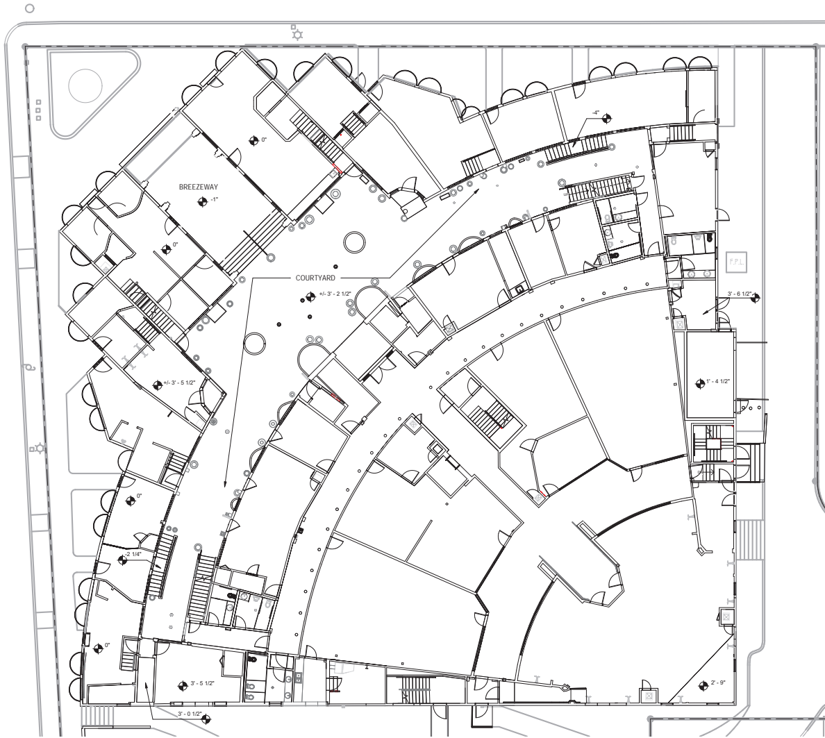
① EXISTING PLAN - LEVEL 01 3/32" = 1'-0"

Scale: 3/32" = 1'-0" Note: When printed on 11 x 17 paper scale is half