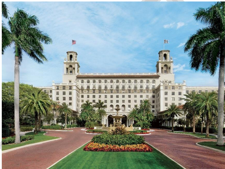
Contemporary Photo of the Breakers, Palm Beach, FL

Early settlers lost no time salvaging and planting the coconuts, which were not native to South Florida, in an effort to launch a commercial coconut industry. In 1880, the first hotel, the Coconut