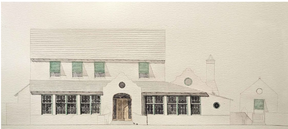
1 PROPOSED NORTH COLORED ELEVATION