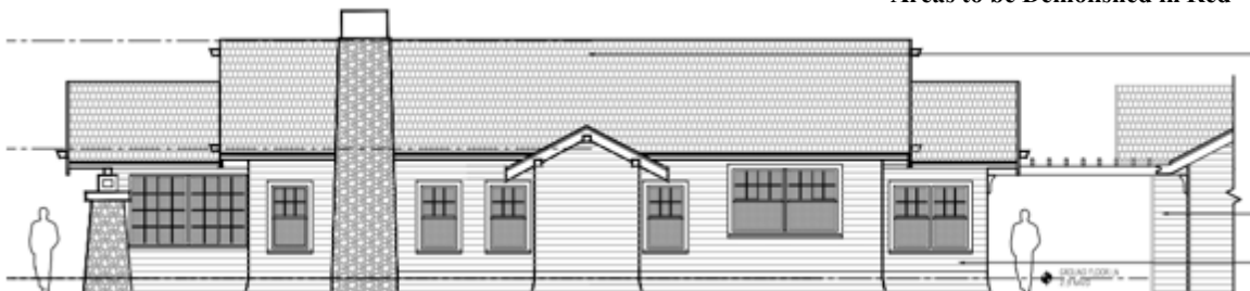
New Enclosed Addition and Pergola

The existing property currently maintains a nonconforming lot coverage of 34.3%, where 30% is permitted for single-family residences in the R-C district. The proposed enclosed addition is slightly larger than the area proposed to be demolished and the new pergola connector also counts towards increased lot coverage. As such, the applicants have requested Variance 2 , to permit lot coverage at 35.74% in lieu of the 34.3% existing and the 30% maximum permitted. The variance amount is as follows: