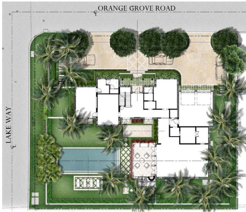
Rendered Site Plan with Landscape, Plan Sheet L8.1

Mechanical equipment is placed within the east and south yards and is screened from public rights-of-way and neighboring homes with masonry site walls and dense vegetation.