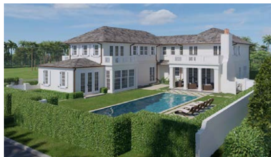
Rendered Rear Perspective w/o Landscape Plan Sheet A-2.2A