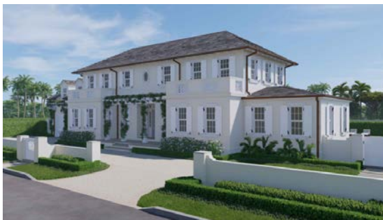
Rendered Front Perspective w/o Landscape Plan Sheet A-2.1A

The architectural design of the residence features a largely symmetrical two-story central mass with a cedar shake hip roof. Two one-story wings flank the primary front façade and utilize masonry parapet walls with open Chippendale-style inserts that resemble second-story balconies, which provide façade setback relief for the second floor. The exterior design utilizes cream stucco-clad walls, white louvered shutters, a lime washed cedar entry door, half-round copper gutters and downspouts, and large aluminum-clad wood double-hung windows and French doors. A two-story attached garage element is set back from the front façade and features second-story projecting dormers and a bracketed trellis over the garage doors.