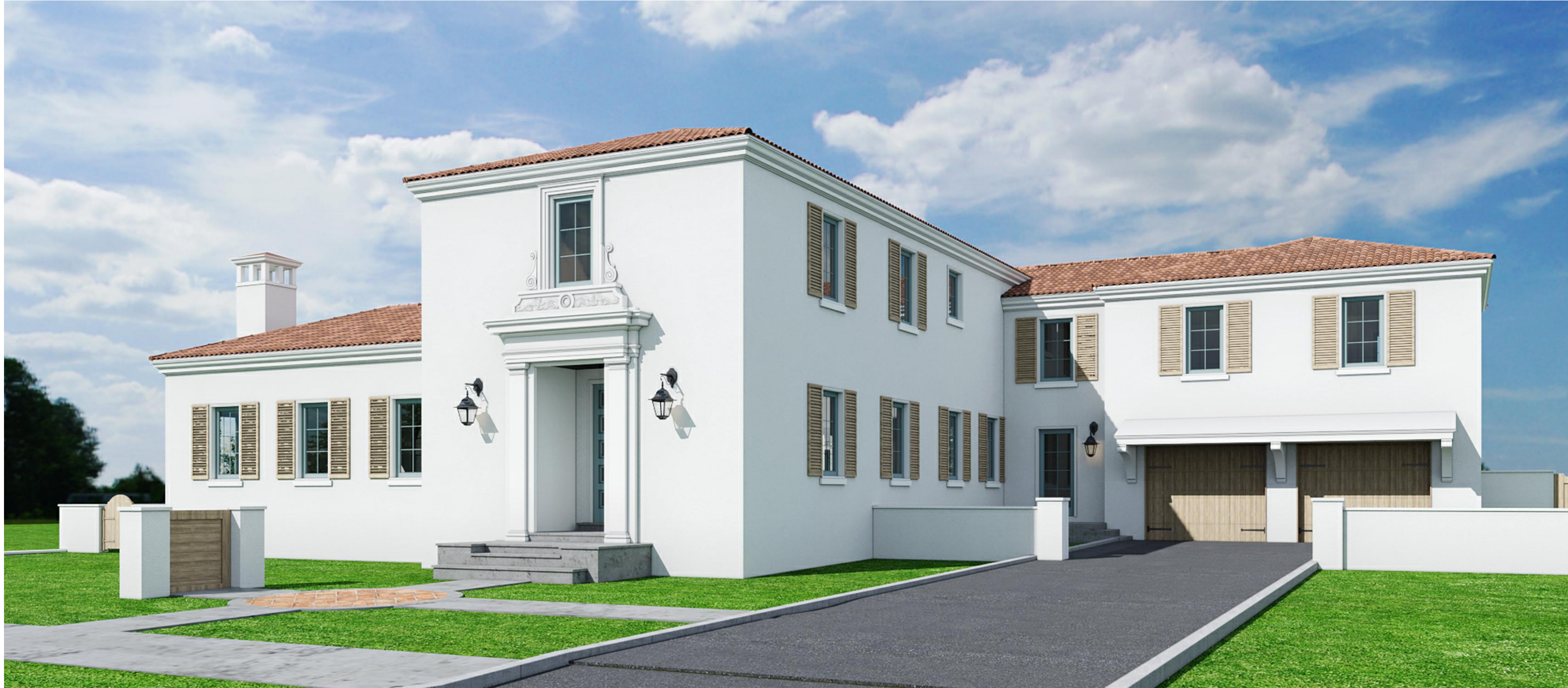
1 RENDERINGS WITHOUT LANDSCAPING N.T.S.