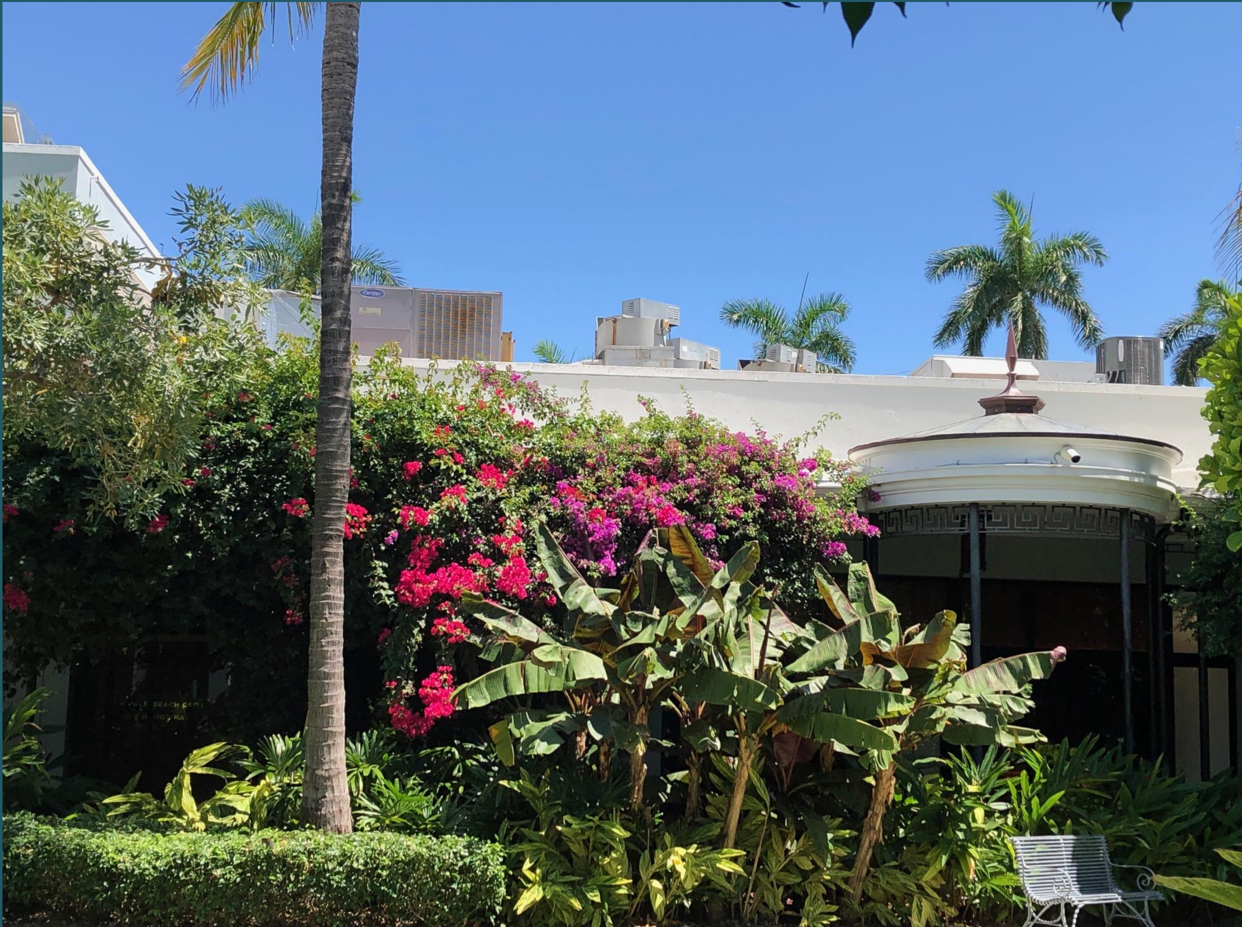
Royal Poinciana Plaza