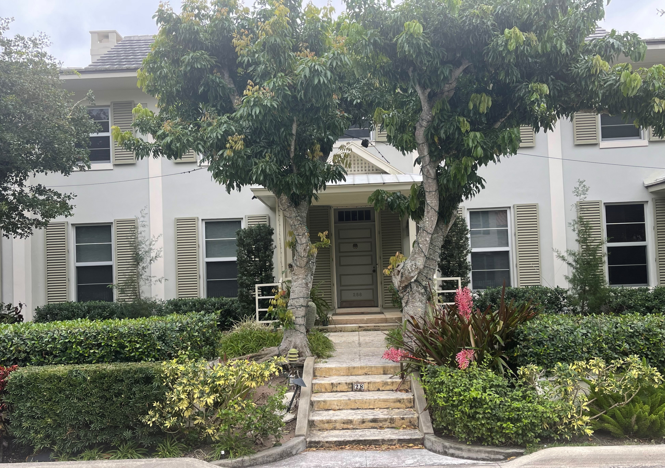
EXISTING 288 QUEENS LN FRONT DOOR