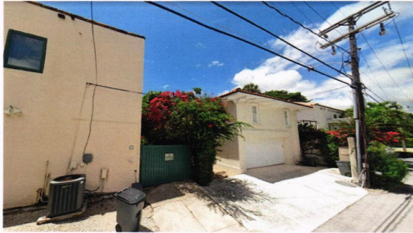
May 2022 Google Street View. Subject property middle.

100 block of Clarke Ave and Barton Ave to the north have nonconforming accessory structures which encroach into the alley setback area. In this regard, the continuance of the existing nonconforming accessory structure would not be an anomaly in the neighborhood.