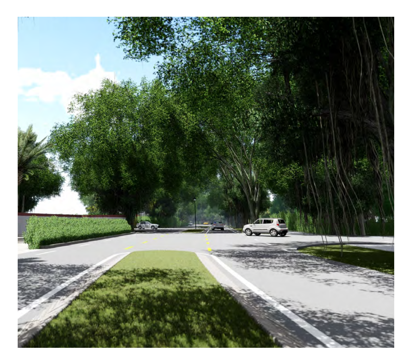
Crescent Drive Facing South Existing