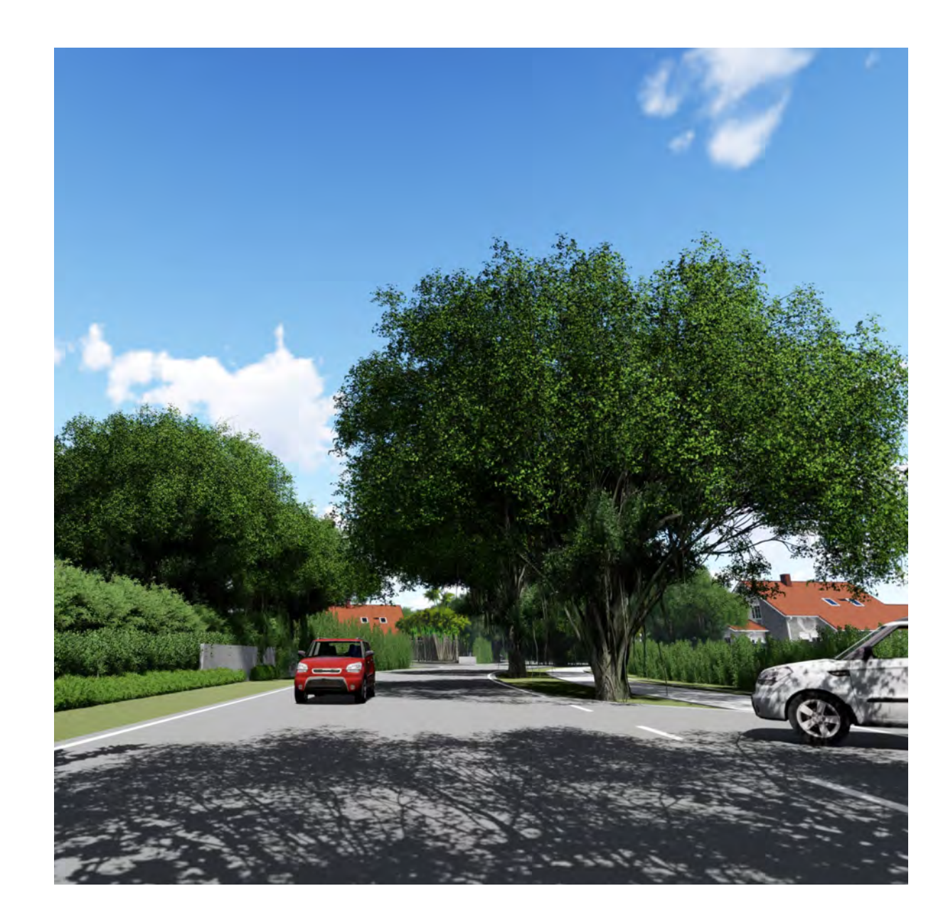
Miraflores Drive Facing South Existing