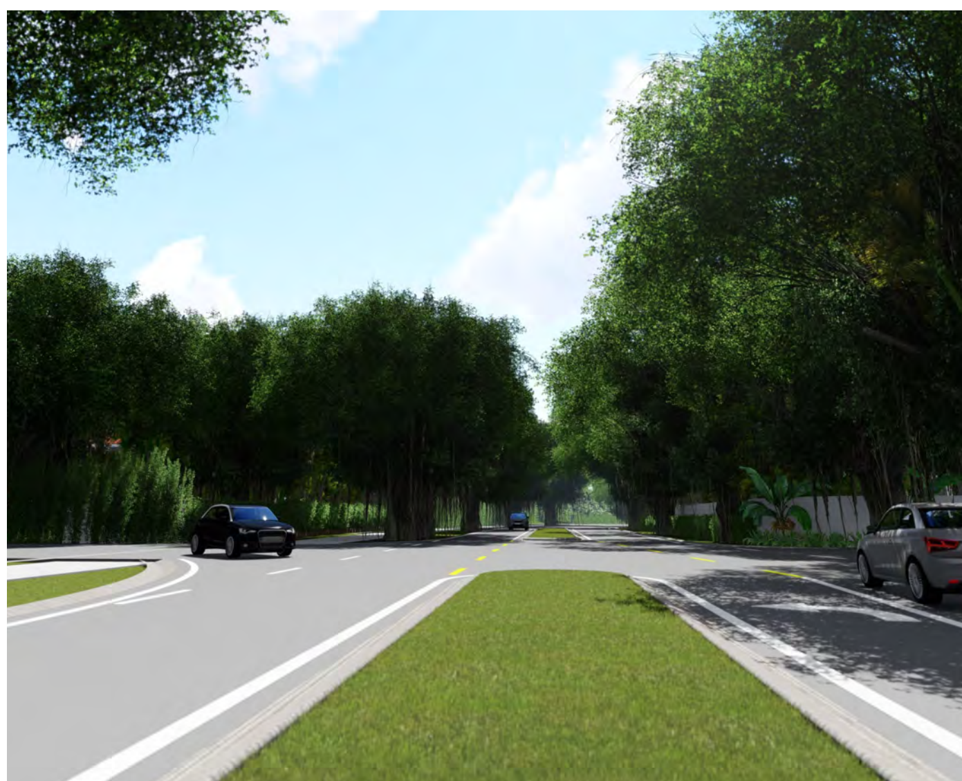
Phipps Estates Dr / Casa Bendita Facing North Existing