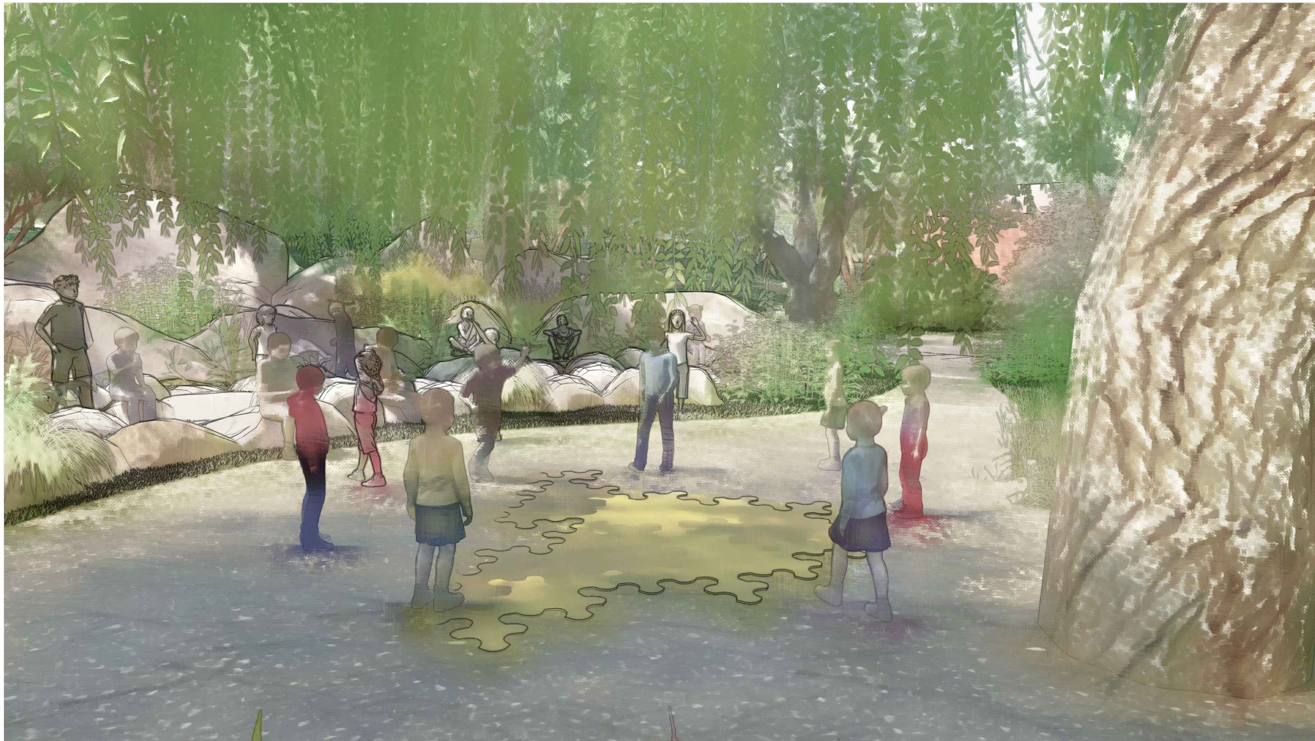
9 OUTDOOR CLASSROOM

This document, together with the concepts and designs presented herein, as an instrument of service, is intended only for the specific purpose and client for which it was prepared. Reuse of and improper reliance on this document without written authorization and adaptation by Kimley-Horn and Associates, Inc. shall be without liability to Kimley-Horn and Associates, Inc.