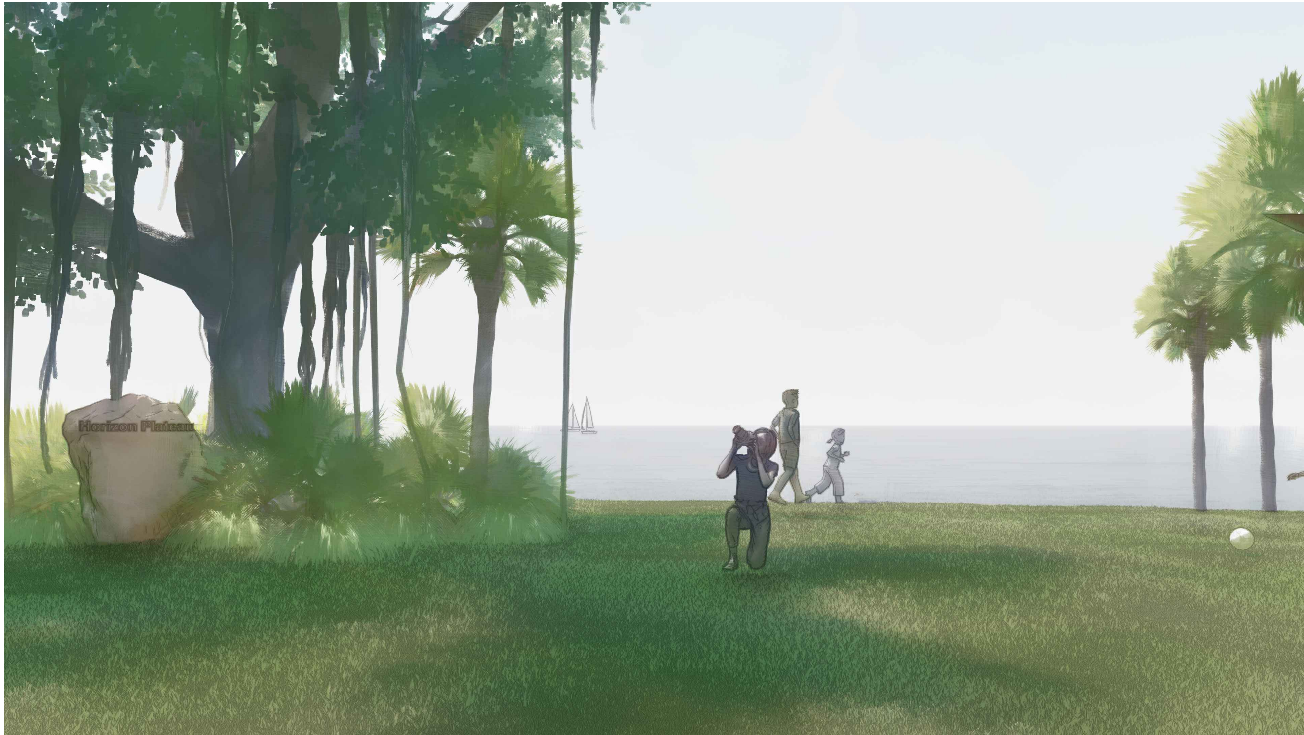
13 HORIZON PLATEAU

This document, together with the concepts and designs presented herein, as an instrument of service, is intended only for the specific purpose and client for which it was prepared. Reuse of and improper reliance on this document without written authorization and adaptation by Kimley-Horn and Associates, Inc. shall be without liability to Kimley-Horn and Associates, Inc.