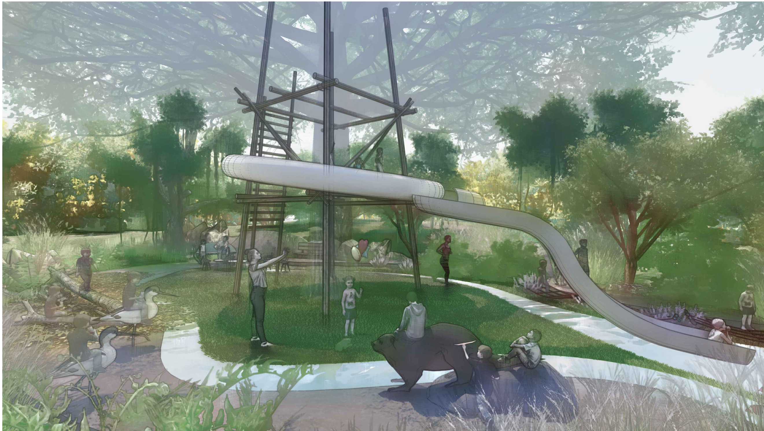
5 DUNE PLAYGROUND

This document, together with the concepts and designs presented herein, is intended only for the specific purpose and client for which it was prepared. Reuse of and improper reliance on this document without written authorization and adaptation by Kimley-Horn and Associates, Inc. shall be without liability to Kimley-Horn and Associates, Inc.