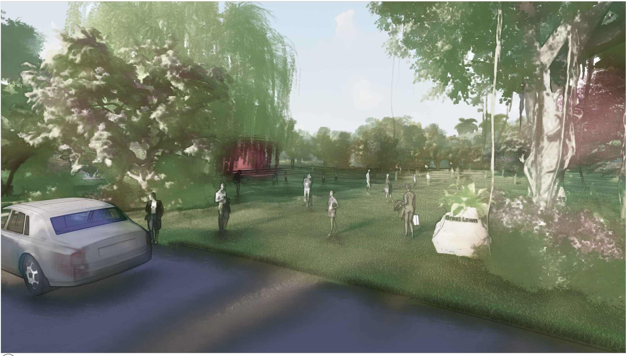
16 GREAT LAWN