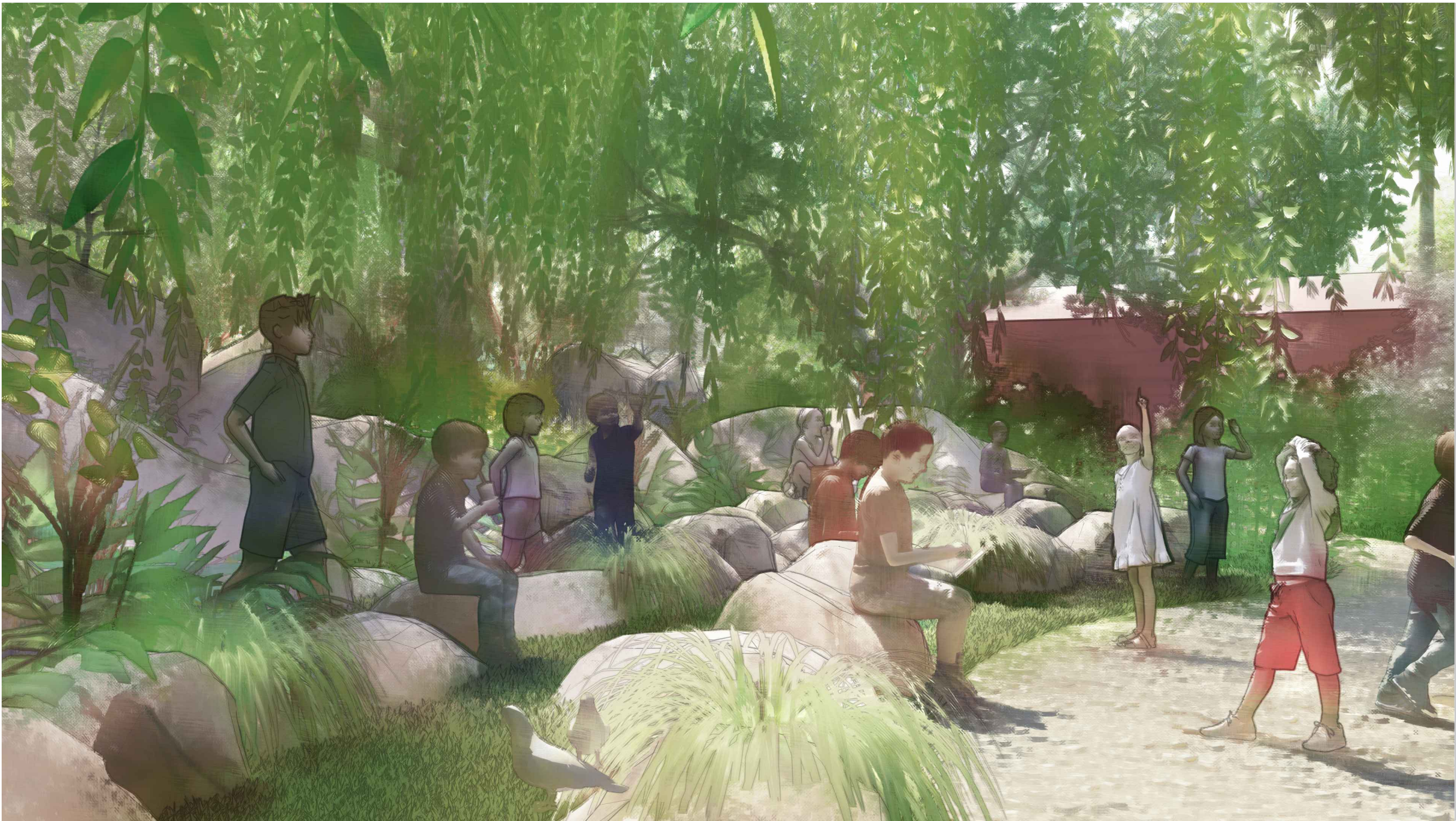
10 OUTDOOR CLASSROOM