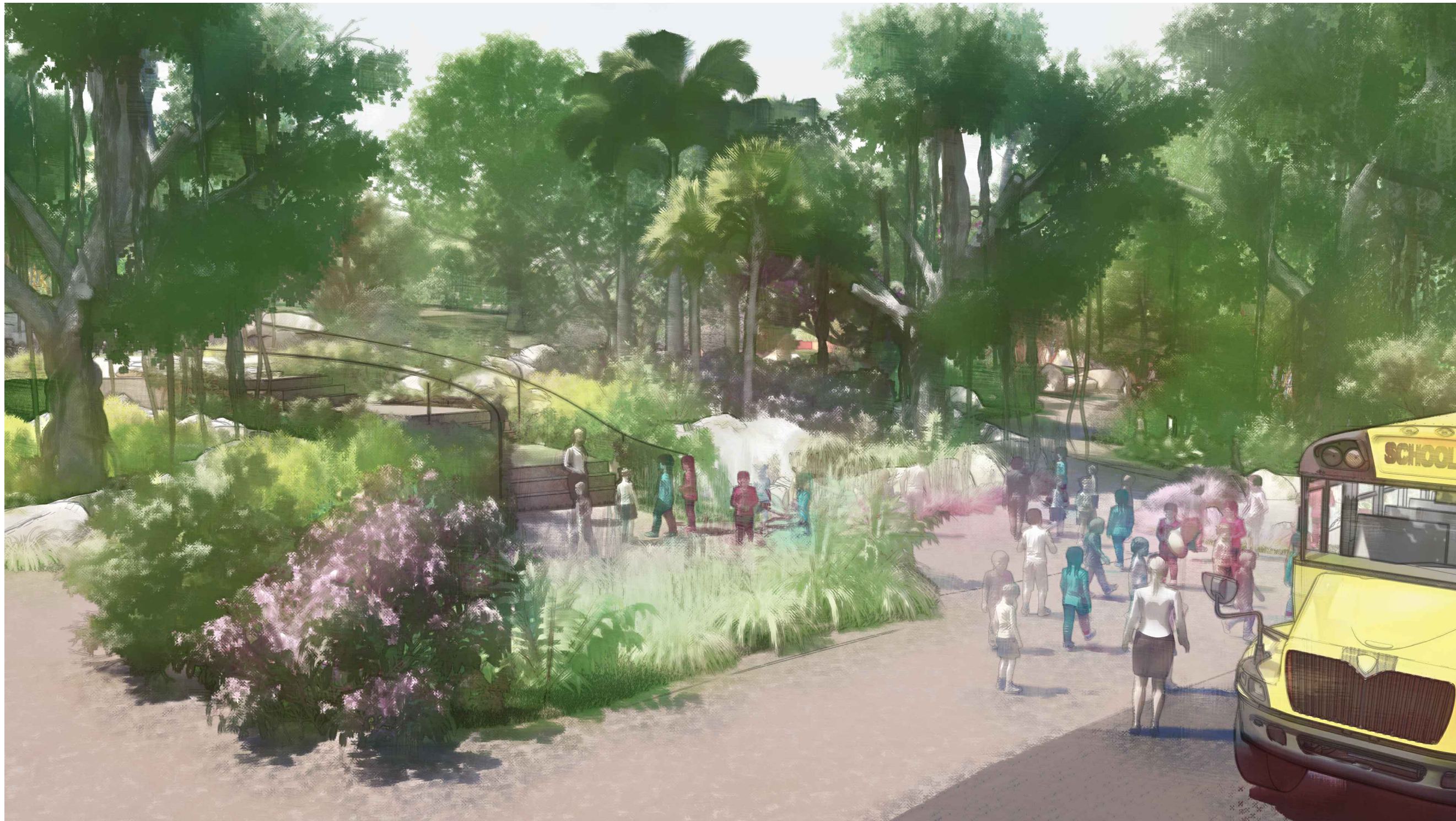
3 ENTRANCE PLAZA