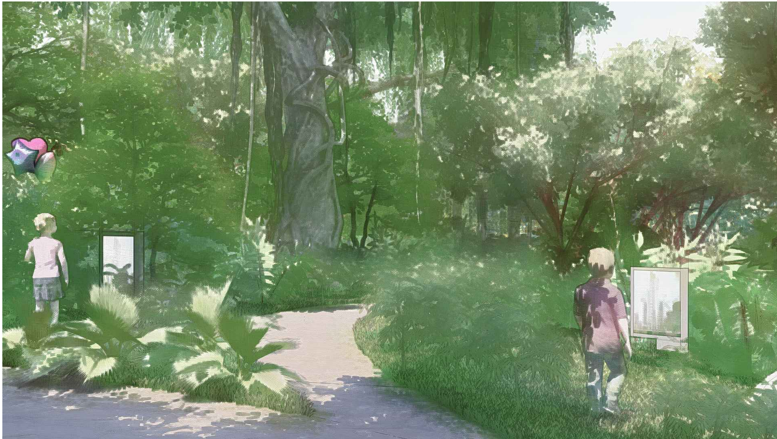
7 OUTDOOR CLASSROOM