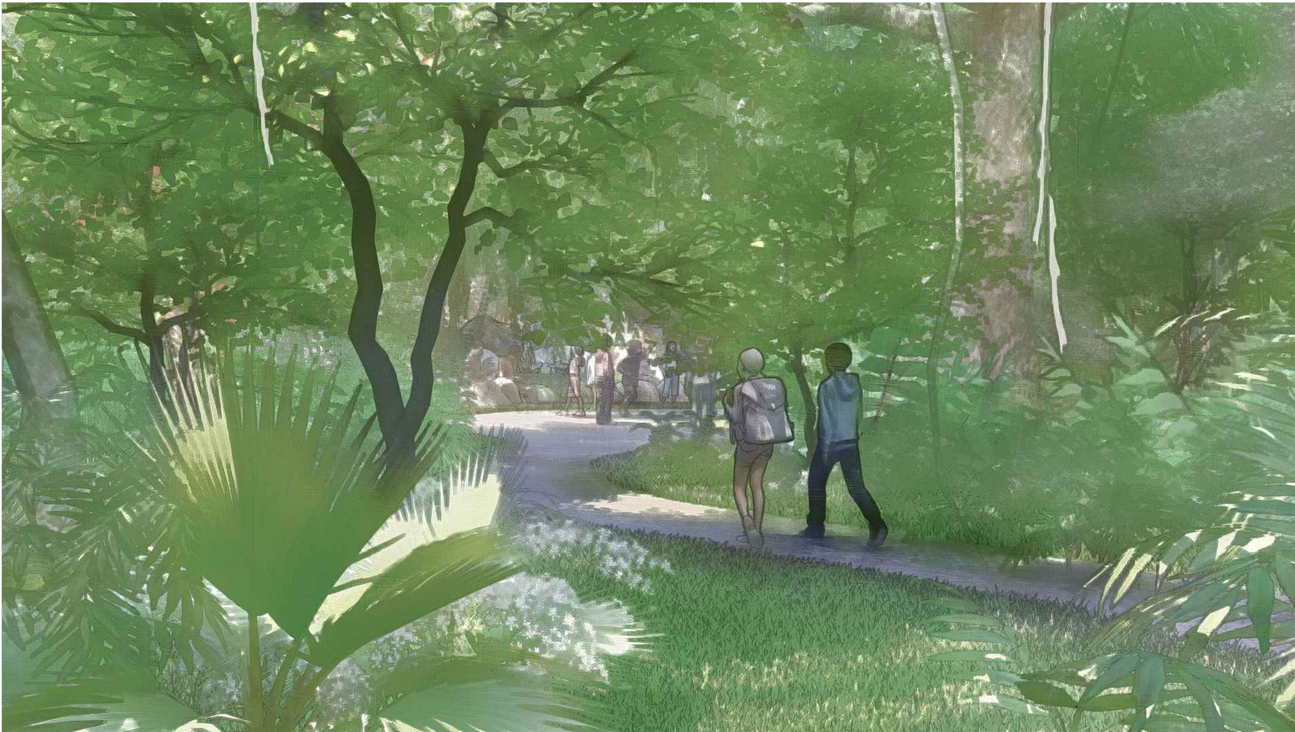
8 OUTDOOR CLASSROOM