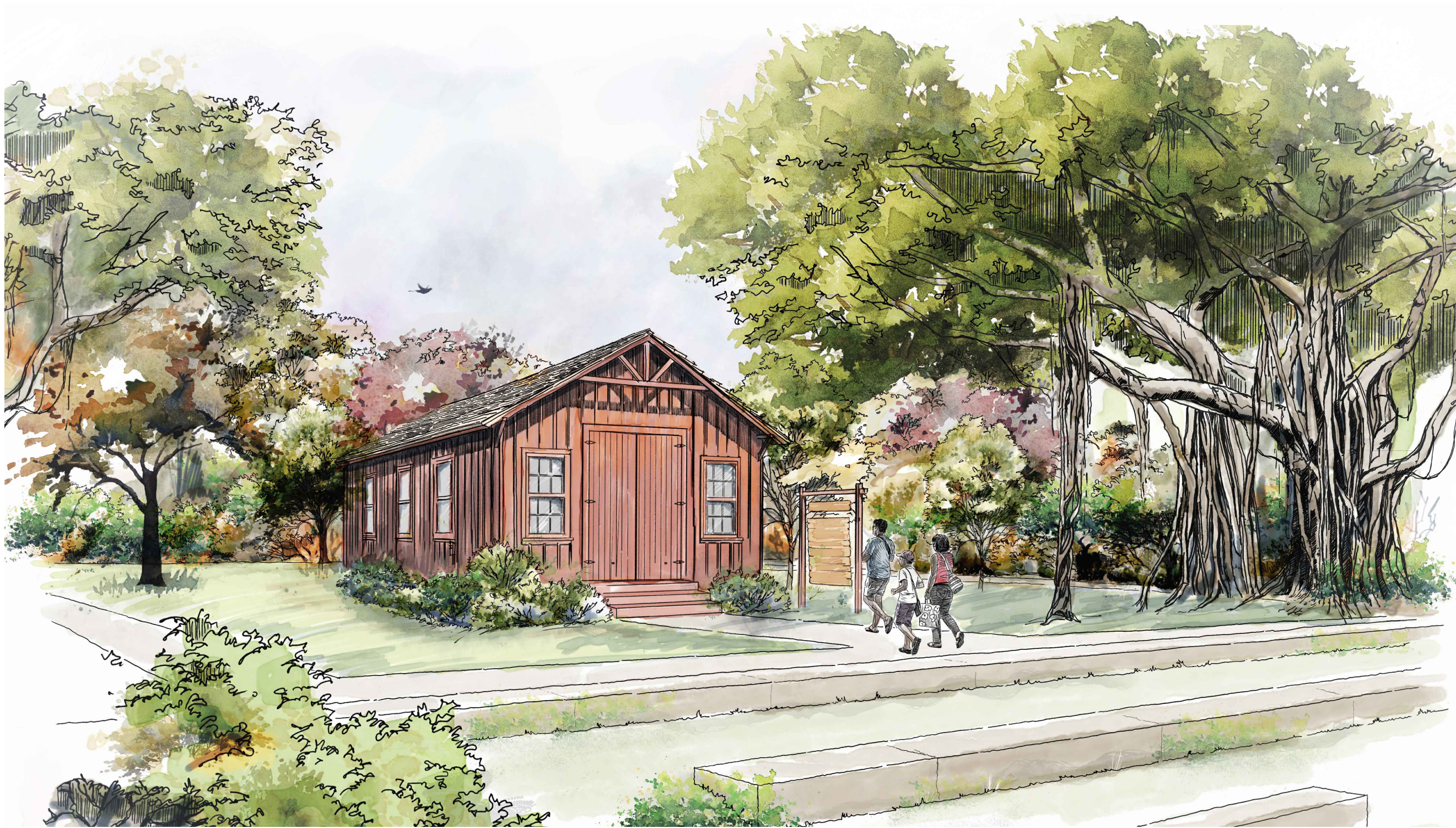
15 LITTLE RED SCHOOLHOUSE