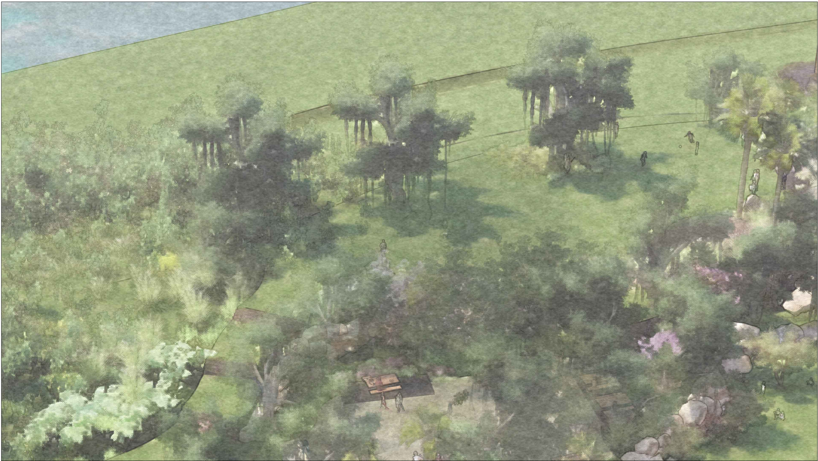
14 HORIZON PLATEAU