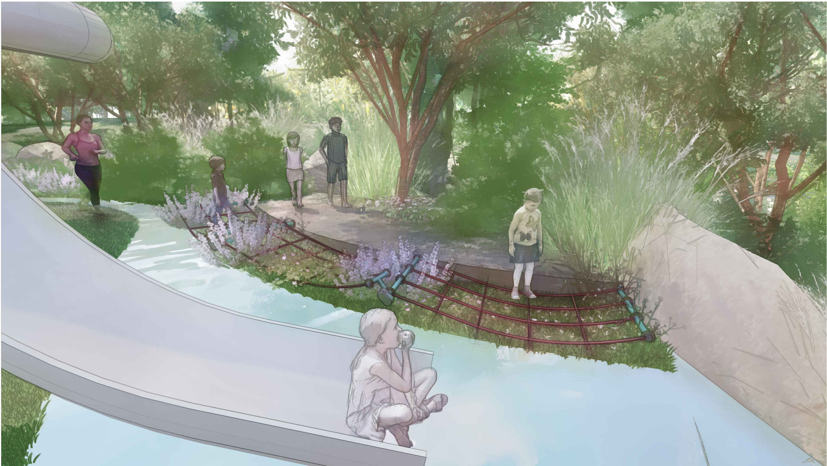
6 DUNE PLAYGROUND