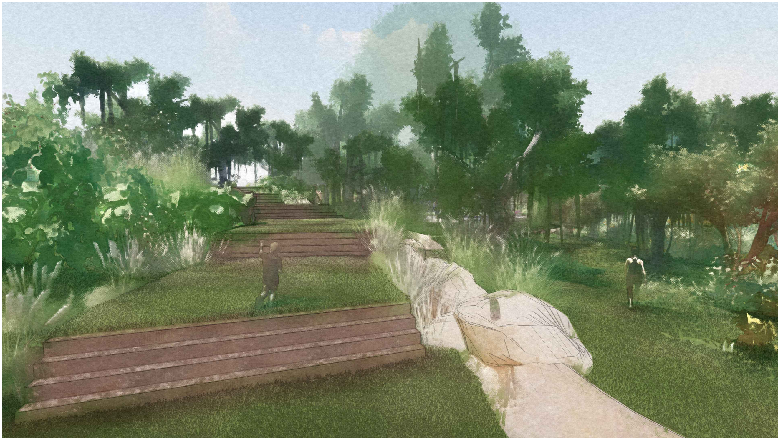
11 PATH TO PICNIC AREA