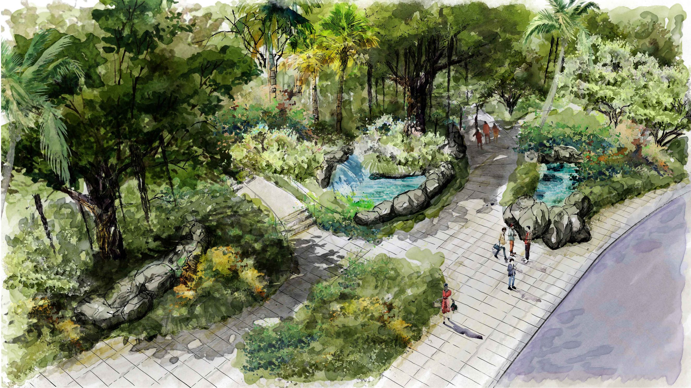
2 ENTRANCE PLAZA