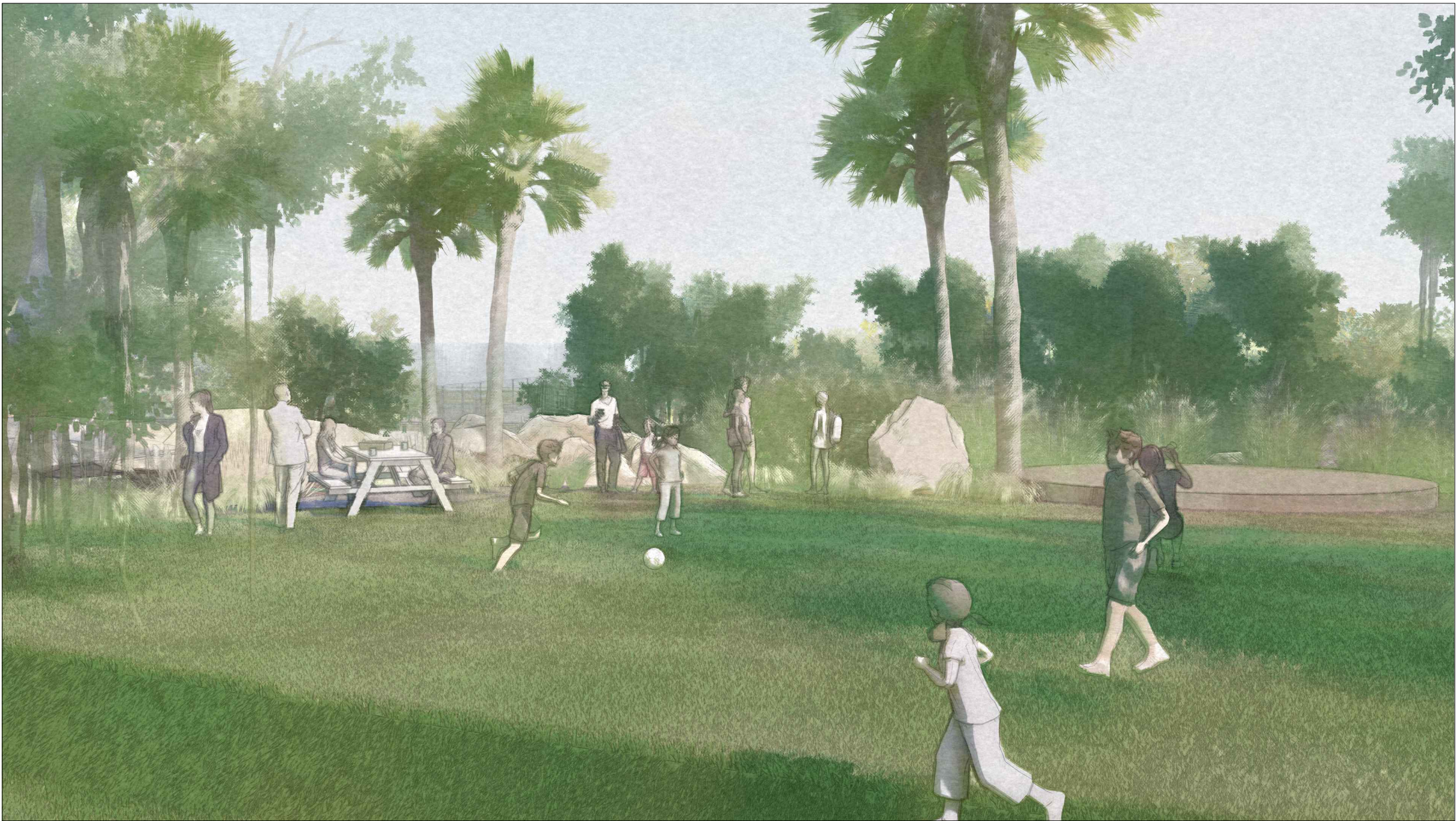
12 HORIZON PLATEAU