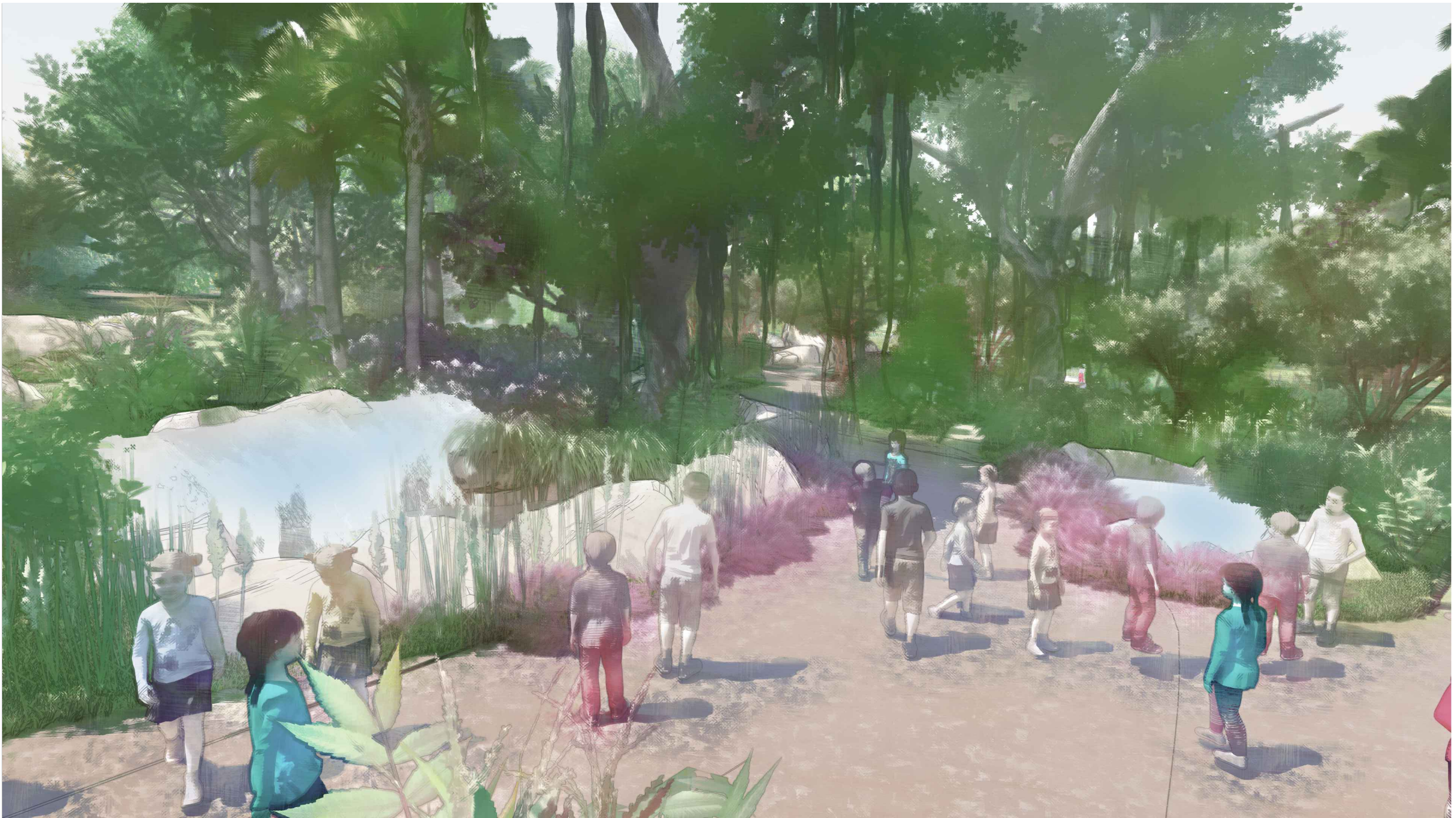
4 ENTRANCE PLAZA