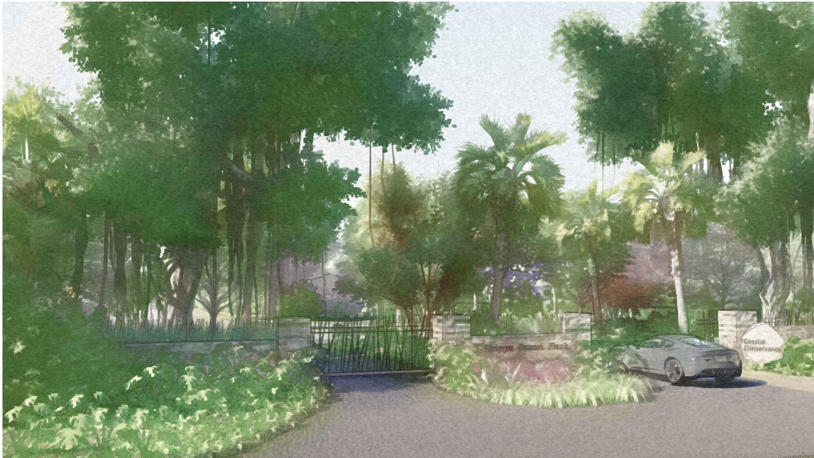
1 MAIN ENTRANCE

This document, together with the concepts and designs presented herein, is intended only for the specific purpose and client for which it was prepared. Reuse of and improper reliance on this document without written authorization and adaptation by Kimley-Horn and Associates, Inc. shall be without liability to Kimley-Horn and Associates, Inc.