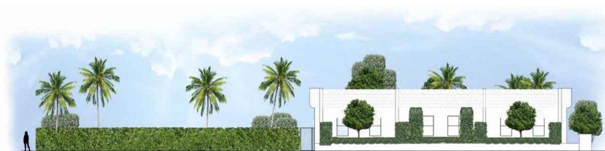
Proposed North Side Elevation