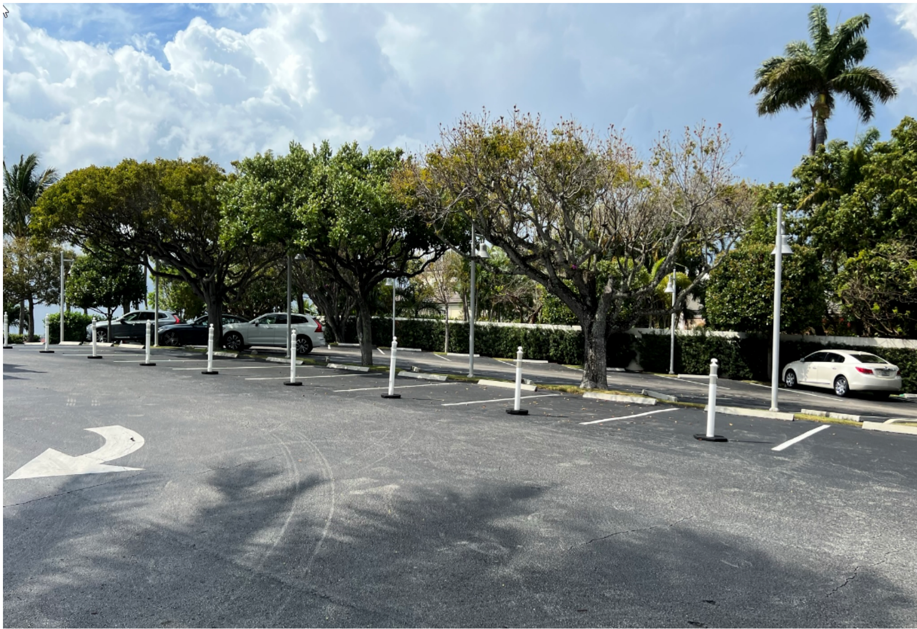
NORTH PARKING LOT