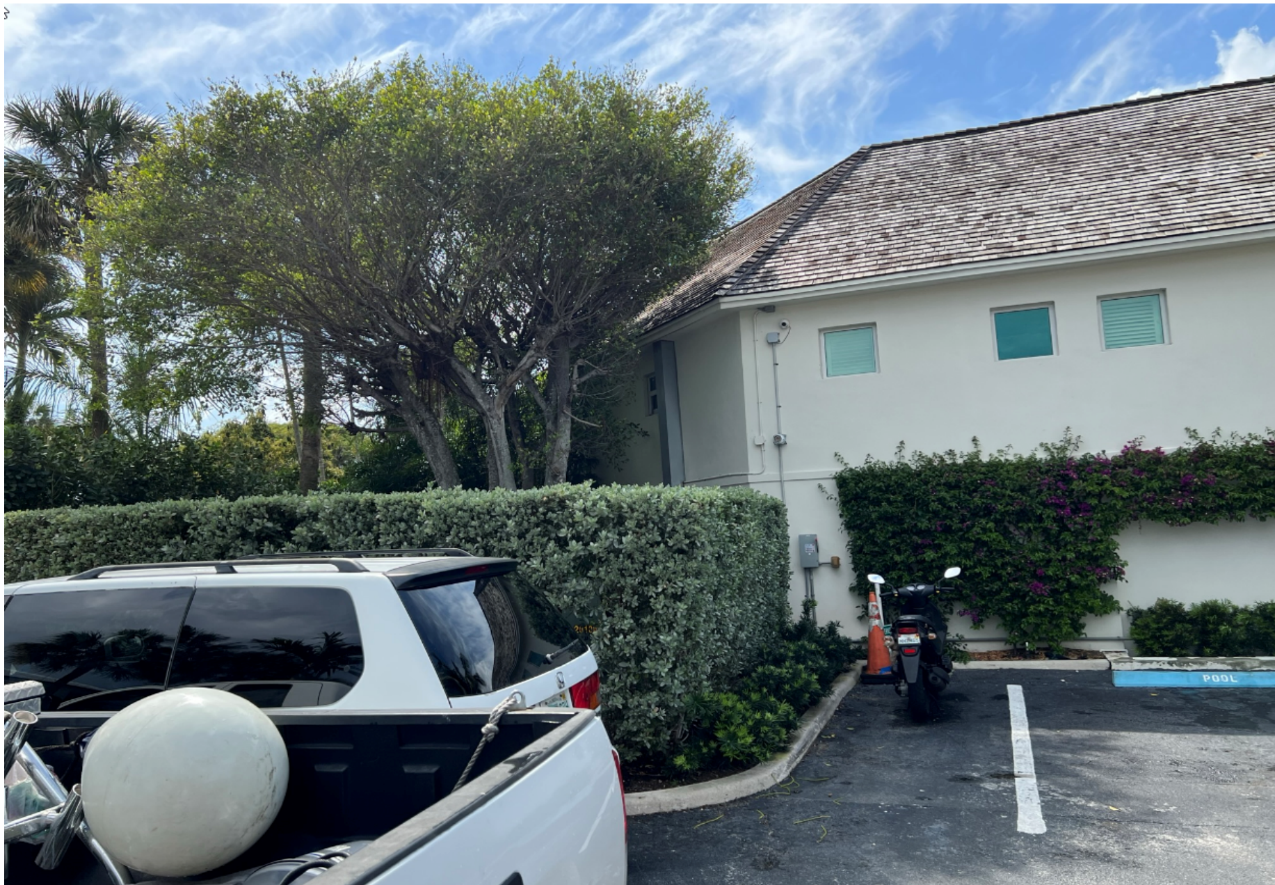
SOUTH EAST FACADE