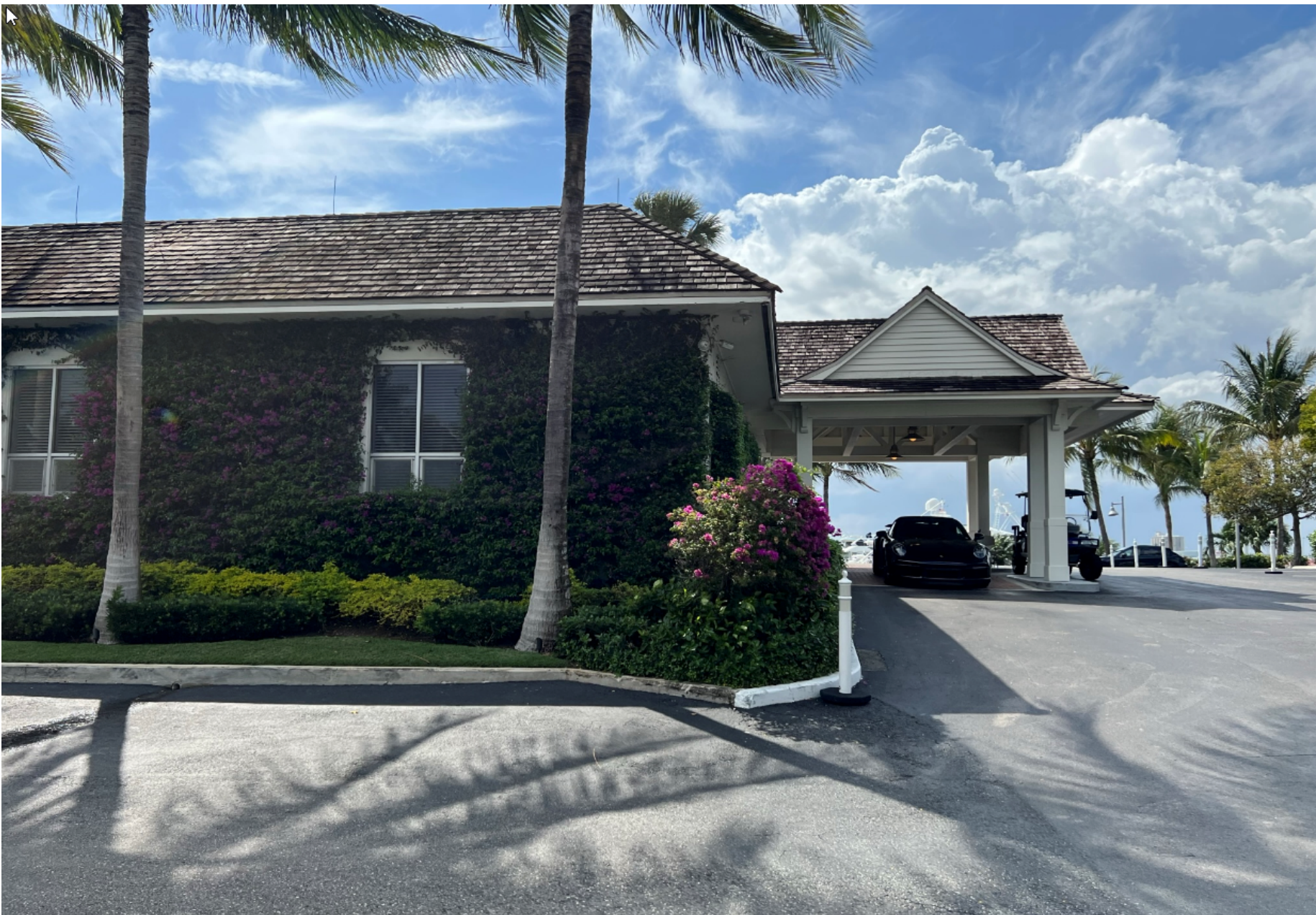
EAST FACADE (NORTH END)