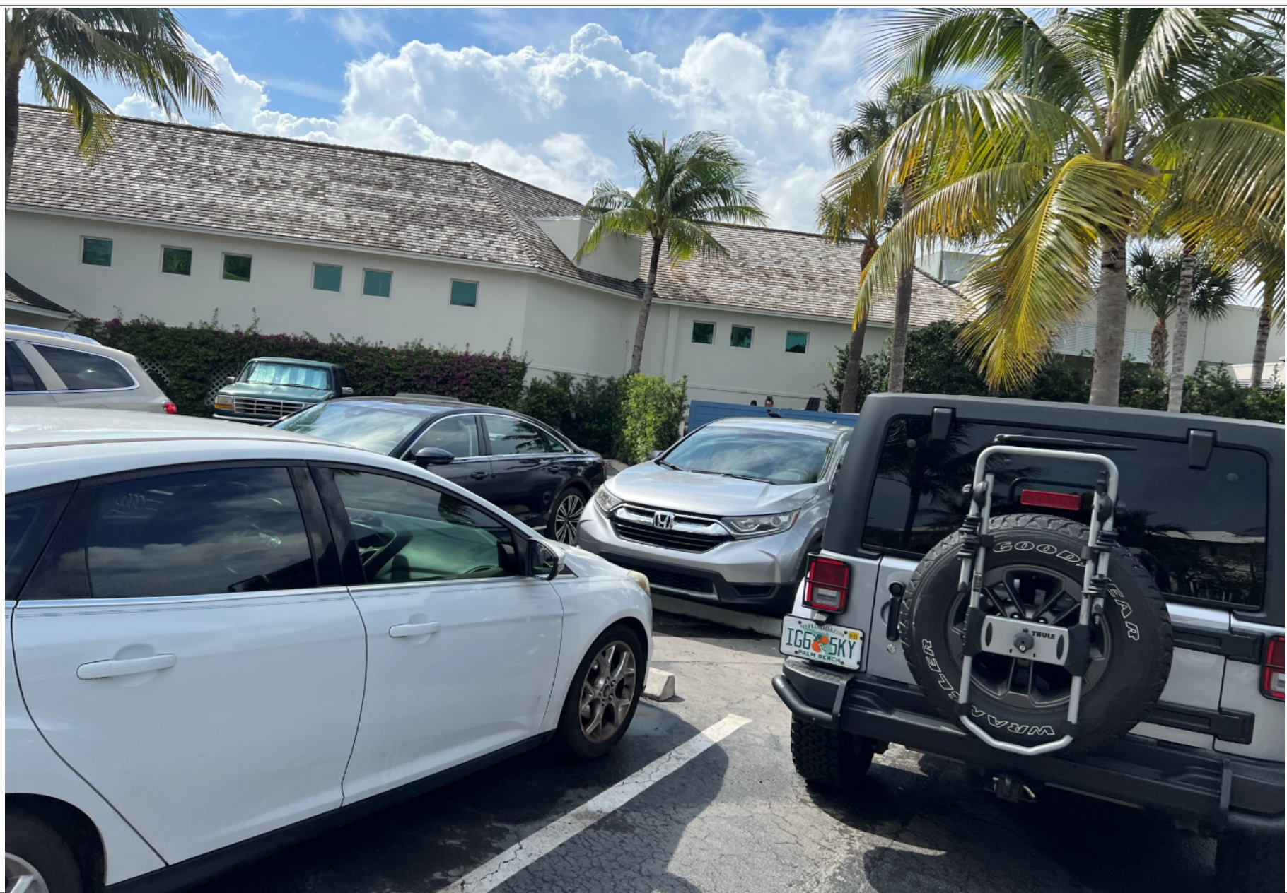
EAST PARKING LOT