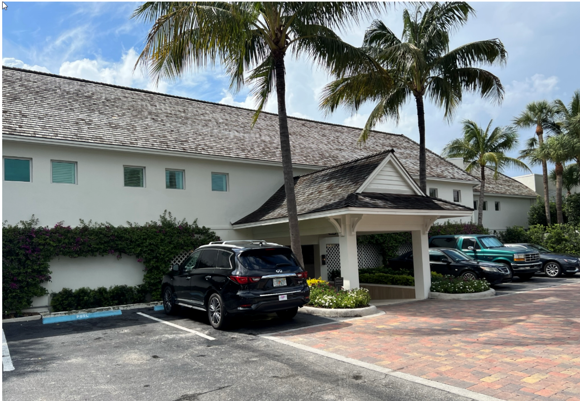
EAST FACADE (SOUTH END)