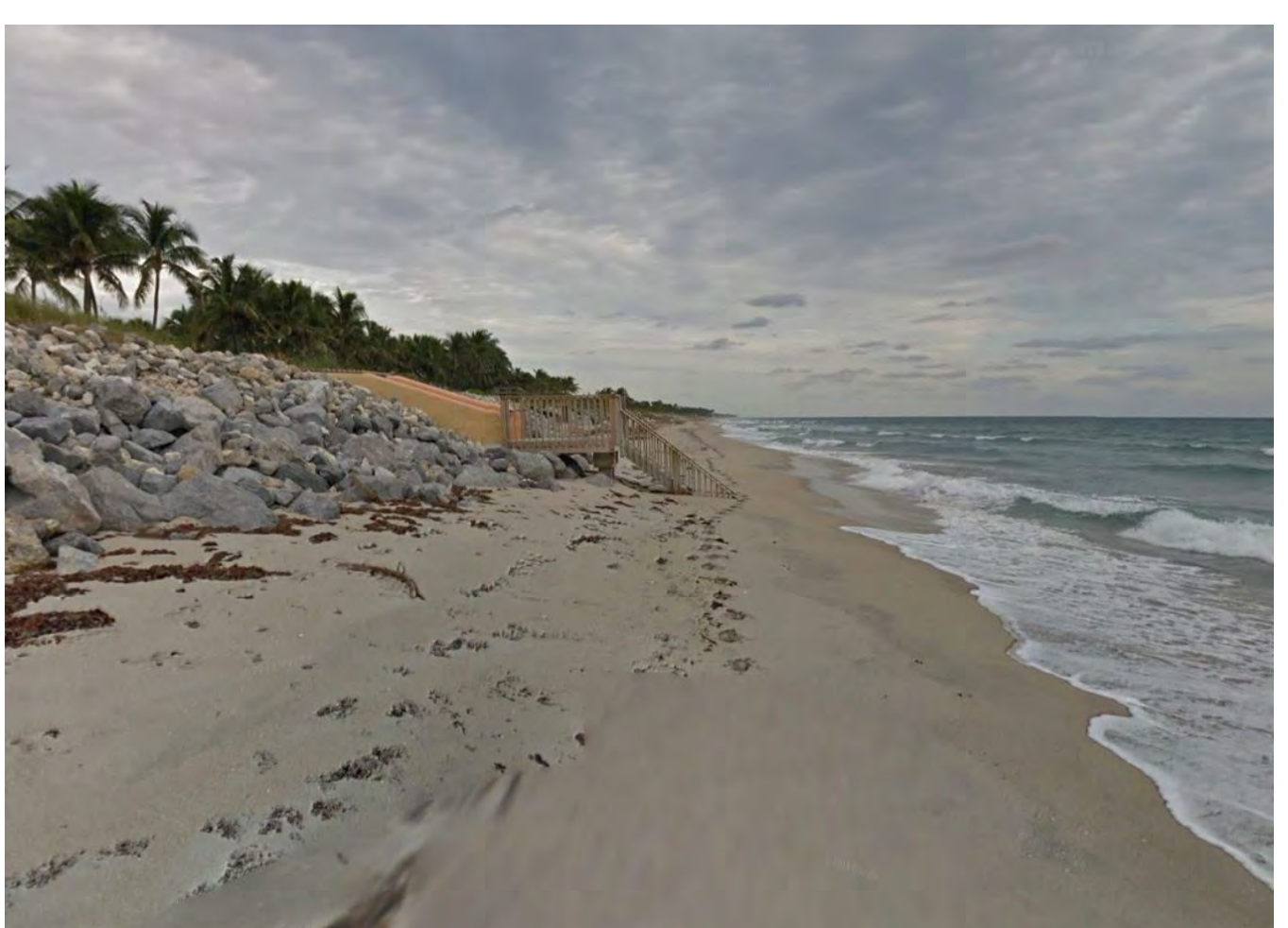
Existing beach side stairs and tunnel of Subject Property