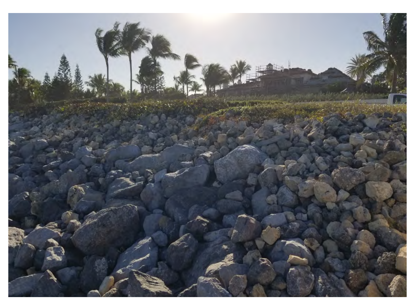
Existing beach revetment and tunnel of Subject Property