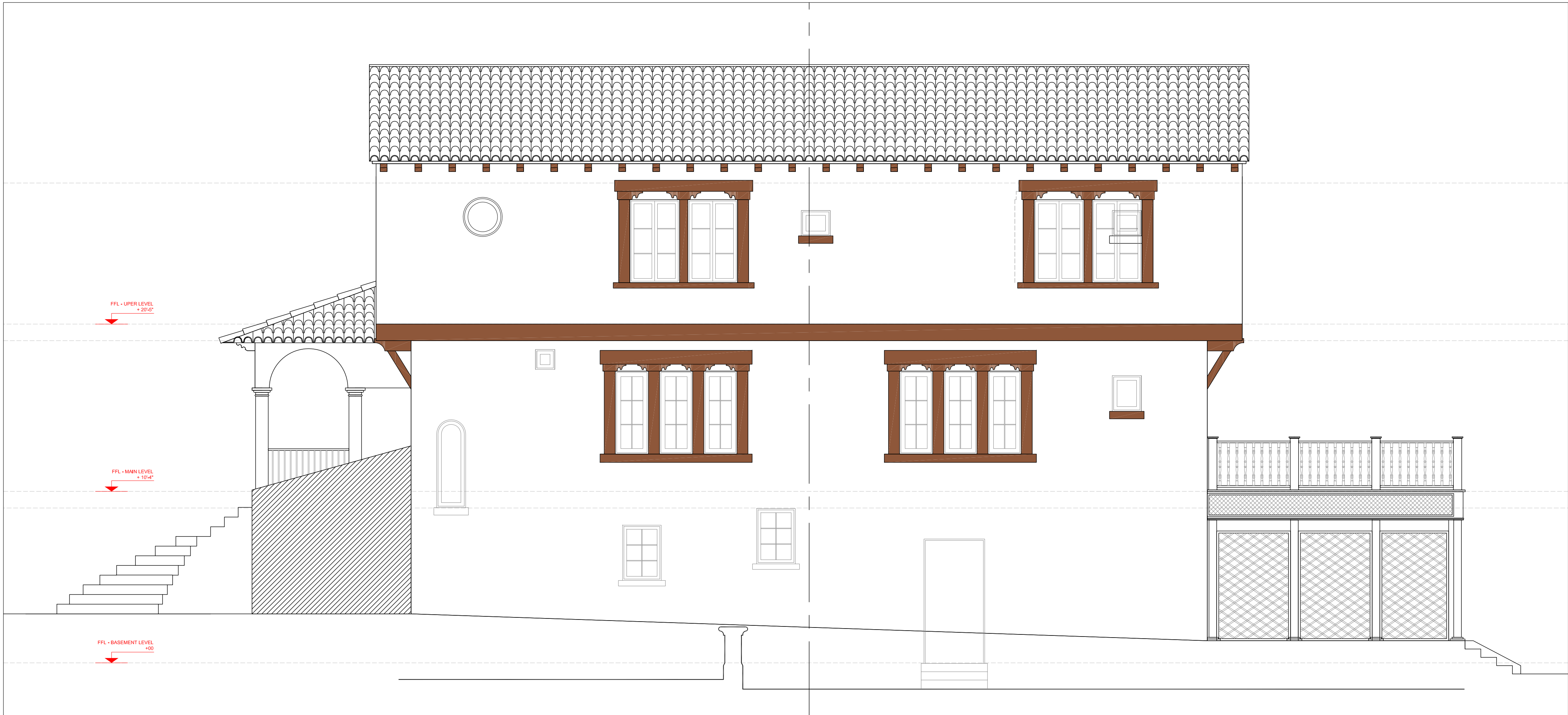
EXISTING SOUTH FACADE