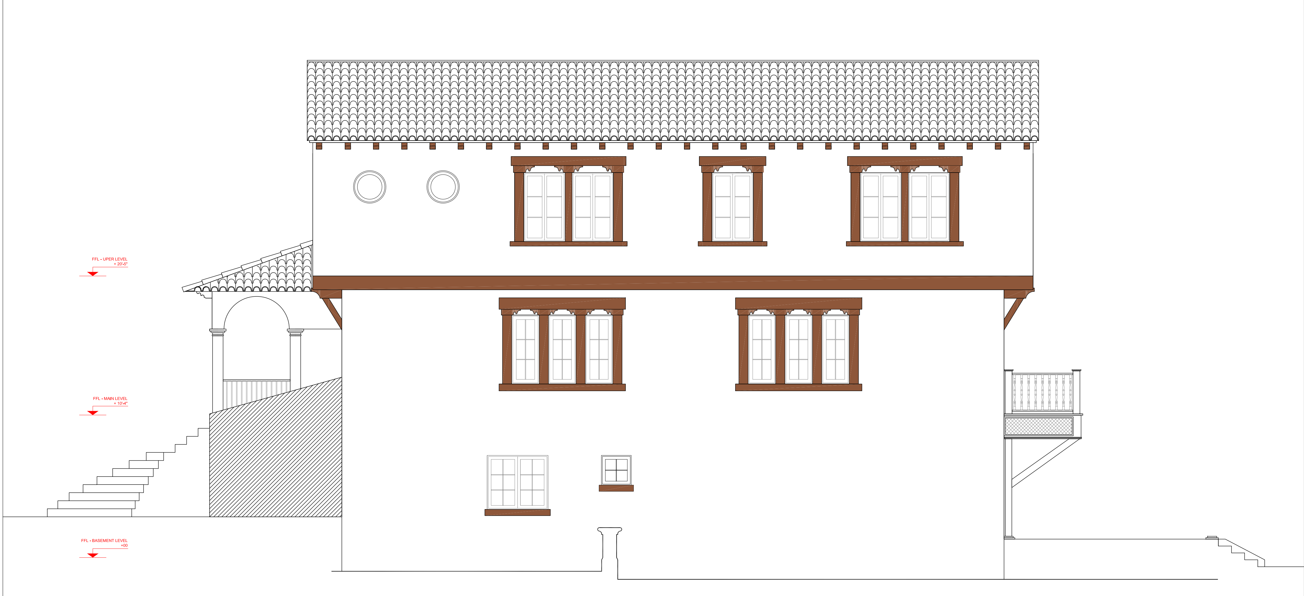
PROPOSED SOUTH FACADE