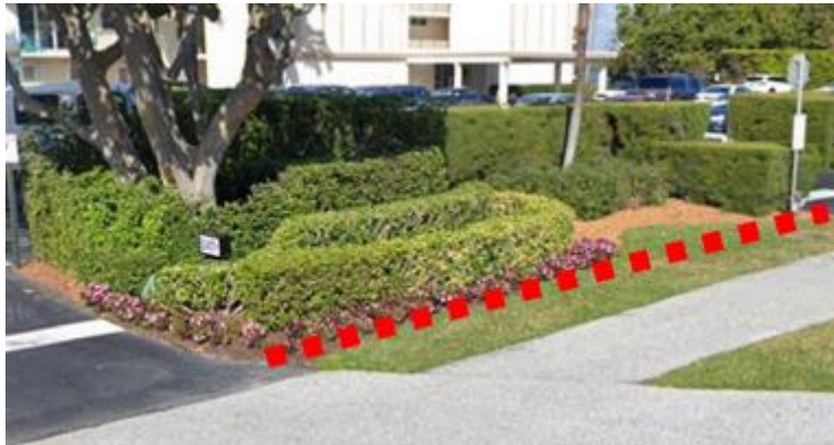
Flower Bed at 2780 South Ocean Blvd

There are several locations where hedges and plant material that is not highly maintained will be impacted in areas that are relatively under-developed. An example of this is on the west side of the roadway across from the condominiums at 2580 and 2600 South Ocean Blvd, where the existing vegetation is along the strip of land between the roadway and the shoreline of the Lake Worth Lagoon.