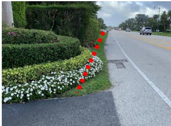
Flower Bed at 2780 South Ocean Blvd

There are two locations where existing flower beds will be impacted by the proposed improvements. At 2760 and 2780 South Ocean Blvd there are flower beds that would require removal or relocation based on the proposed improvements.