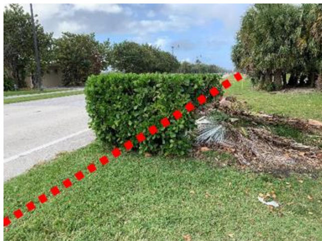
Hedge at 2500 South Ocean Blvd

In addition to the removal of sod, there are hedges and shrubs that will be impacted by the proposed improvements. As shown below, at 2500 South Ocean Blvd, there is a sea grape hedge that is immediately adjacent to the roadway on the east side. This hedge is used by the condominium association to hide landscape debris that has been trimmed and is waiting for pickup by the Town's waste collection crews. The proposed improvements would require removal of the hedge and possible relocation farther back.