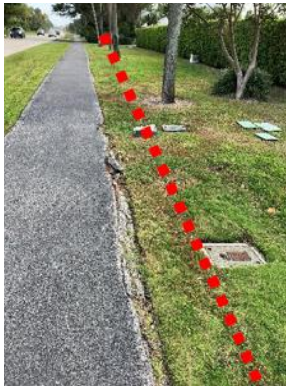
Existing Water Meter and Irrigation Valve Boxes