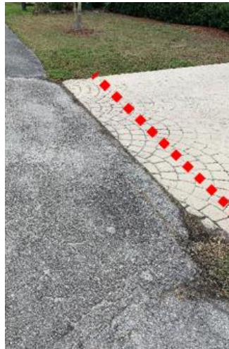
Driveway at 2300 South Ocean Blvd

The majority of the driveways along the proposed project corridor are asphalt and as such will not be significantly impacted by the proposed improvements. There are however four locations where specialty driveways are installed that will be impacted by the proposed widening of asphalt pavement. The types of driveways impacted are either stamped concrete or pavers. The specialty driveways that will be impacted are shown below: