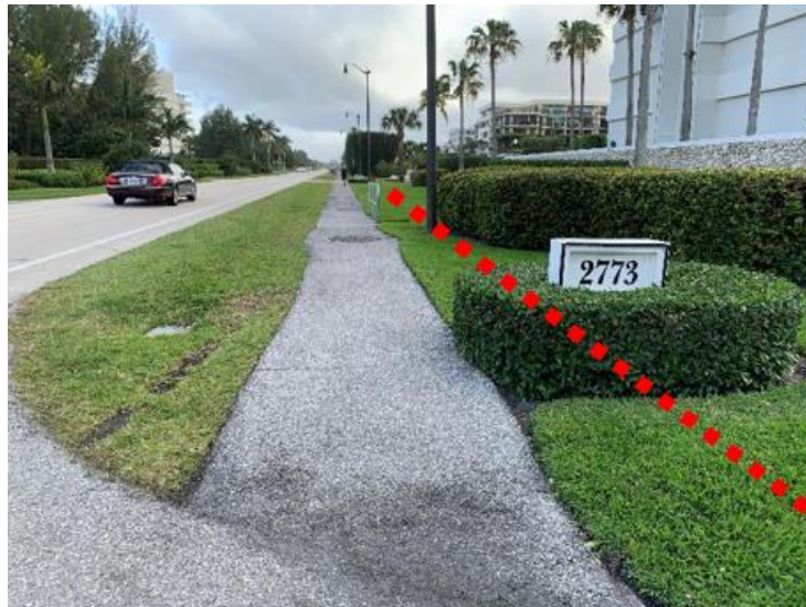
Lighted sign at 2773 South Ocean Blvd

There are two locations where private condominium signage that has low voltage up-lighting will be impacted by the proposed widening of the path on the west side of the roadway. The signage at 2773 South Ocean Blvd is surrounded by a green island ficus hedge and would need to be completely relocated west based on the proposed alignment. The signage at 2860 South Ocean Blvd would need to be relocated to the west as well as the accompanying low-voltage lighting.