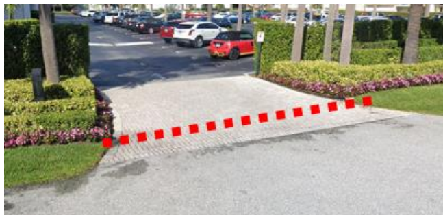
Driveway at 2760 South Ocean Blvd