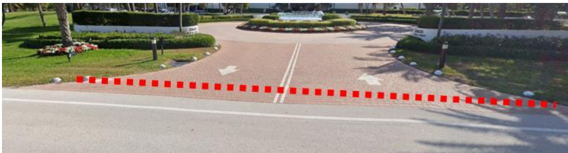
Driveway at 2660 South Ocean Blvd