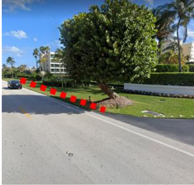
Seagrape at 2770 South Ocean Blvd

At 2770 South Ocean Blvd there is a large sea grape that is approximately 6 feet from the edge of pavement. Although the tree may not necessarily need to be removed, it is expected to be impacted by the construction of the potential improvements considering the roots typically extend to the drip line of the canopy which is near the existing edge of pavement.