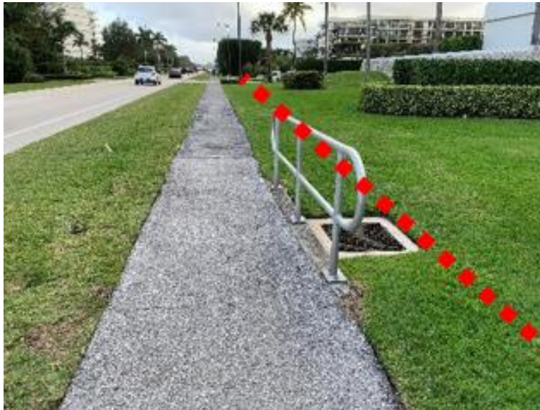
FDOT Catchbasin in front of 2860 South Ocean Blvd

Since this portion of SR-A1A is a FDOT roadway, the drainage system is owned and operated by the State agency. It is assumed that the increase in pavement will also increase the runoff generated after rainfall events and as such may require the construction of additional drainage infrastructure. The existing system includes drainage catchbasins and inlets along the west side of the roadway that will need to be retrofit to accommodate the proposed improvements. Below are examples of FDOT drainage inlets that will need to be raised to match the new grades and retrofitted to provide a safe walking surface for pedestrians on the new path.