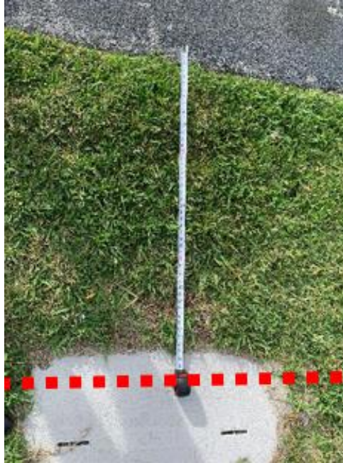
Existing Communication Pullbox