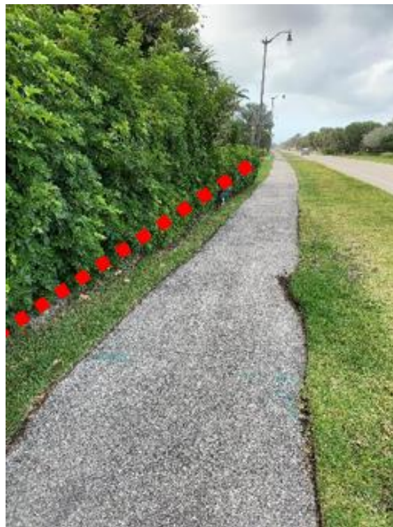
Hedge along the west side of SR-A1A

There are several locations where hedges and plant material that is not highly maintained will be impacted in areas that are relatively under-developed. An example of this is on the west side of the roadway across from the condominiums at 2580 and 2600 South Ocean Blvd, where the existing vegetation is along the strip of land between the roadway and the shoreline of the Lake Worth Lagoon.