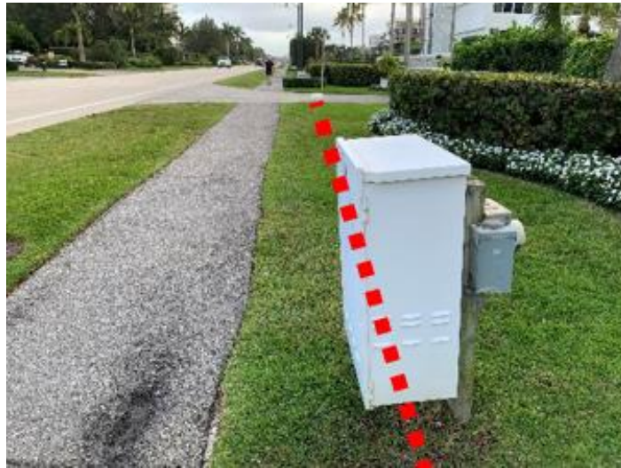
Existing Communications Utility Panel