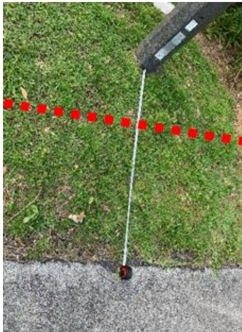
Existing Street Lighting Pole