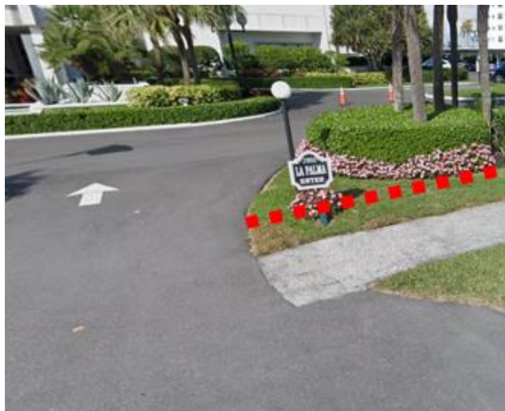
Lighted sign at 2860 South Ocean Blvd