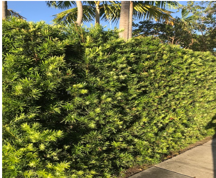
Photo: PODOCARPUS. Lately experts' favorite tall hedge for South Florida . This photo taken by Martha Greenwald days ago at a very fine Palm Beach home. Podocarpus is used by experts as a tall hedge in manicured gardens as it too can be shaped, and is very attractive (not possible with ugly massive Ficus Benjamina ; if with figs, even more a problem). Podocarpus is "salt-tolerant, hot and cold tolerant, so does well in any area of South Florida. Hot sun or shade is just fine." South Florida plant guide . See link:

https://www.south-florida-plant-guide.com/podocarpus.html#:~:text=Plant%20specs&text=It's%20evergreen%2C%20salt%2Dtolerant%2C,than%20in%20a%20sunny%20one .