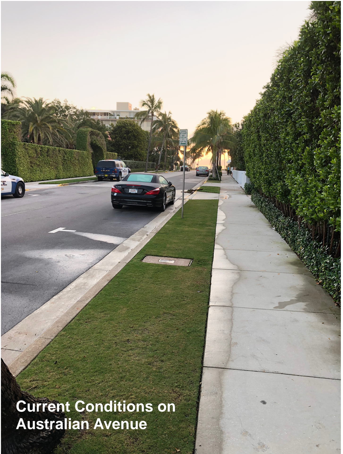
Current Conditions on Australian Avenue