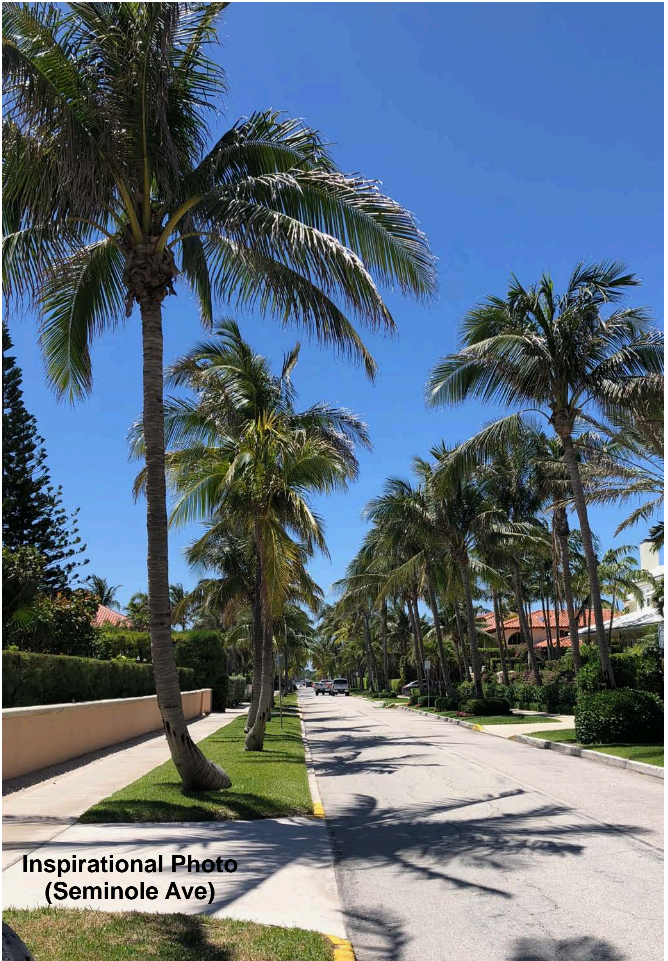
Inspirational Photo (Seminole Ave)