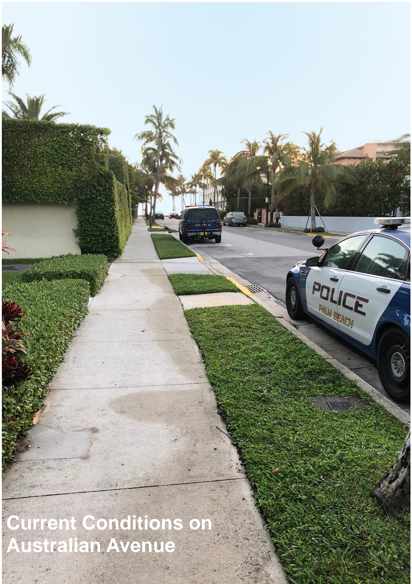
Current Conditions on Australian Avenue