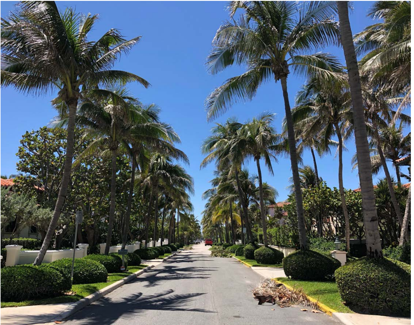
Inspirational Photo (Everglade Ave)