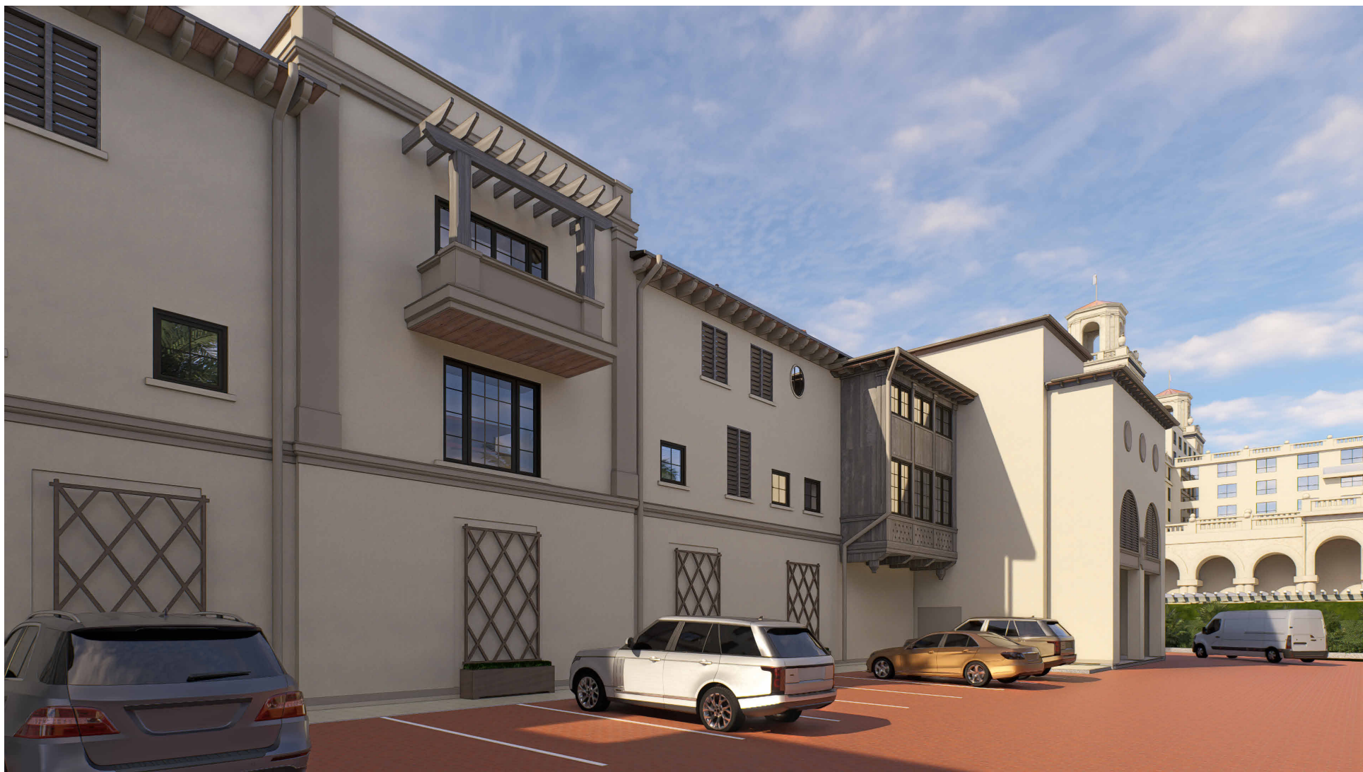
MATCHING VIEW WITHOUT LANDSCAPE