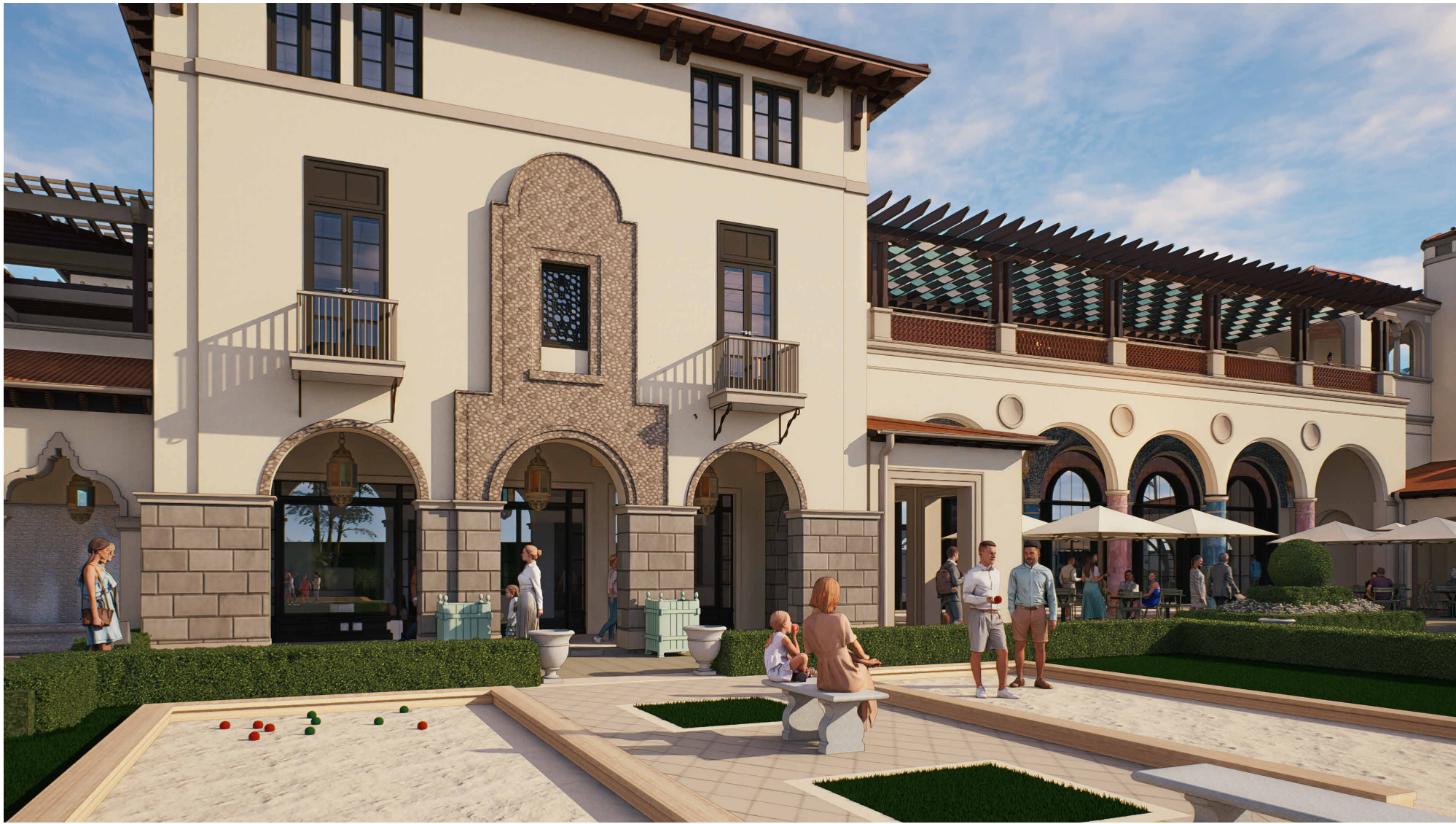
MATCHING VIEW WITHOUT LANDSCAPE