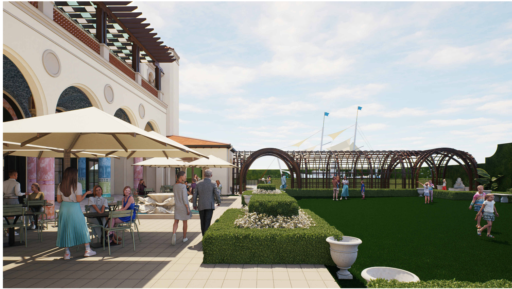
MATCHING VIEW WITHOUT LANDSCAPE