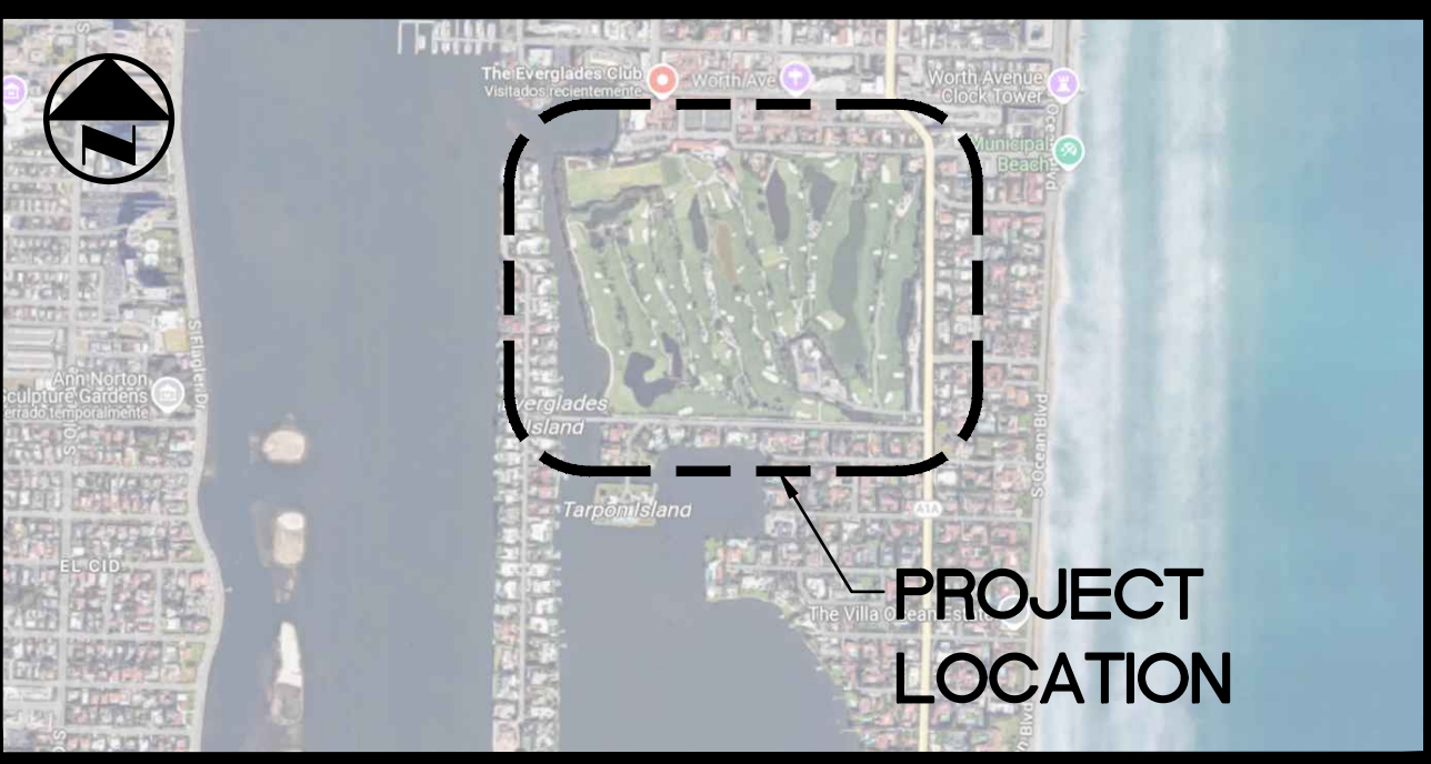
LOCATION MAP SCALE: NOT TO SCALE