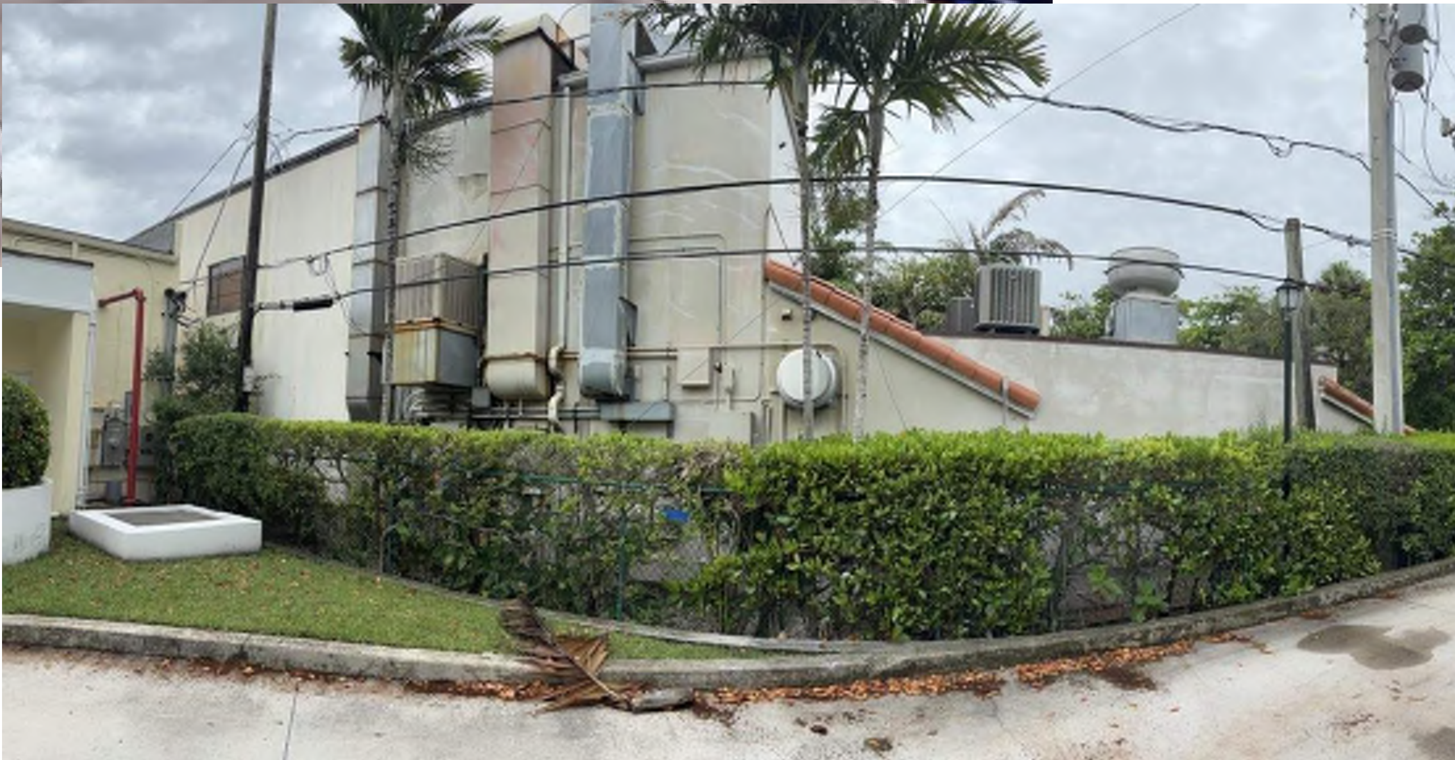
EXISTING BIRD'S EYE PHOTO