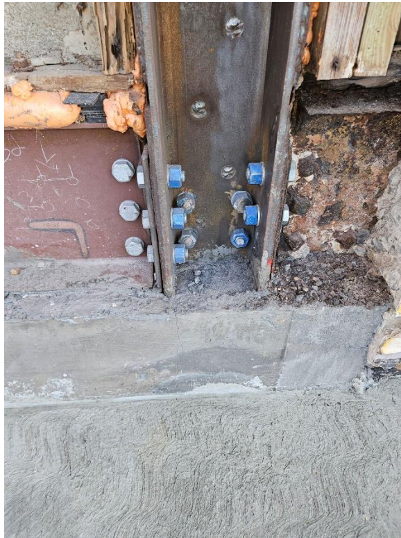
New replaced beam on the Left. Old deteriorated beam on the right.