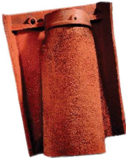
TERRA COTTA BARREL TILE

The applicant is proposing a change to previously approved roofing material on a new lakefront residence. A terracotta true barrel tile was approved, however, a Redland clay S-tile was installed on the structure. Staff was made aware of this, and immediately reached out to the architect and contractor with direction to either remove the S-Tile and installed the approved material, or to make an application to ARCOM for approval of the S-Tile material. The applicant opted with the latter option, hence the application before the commission today.