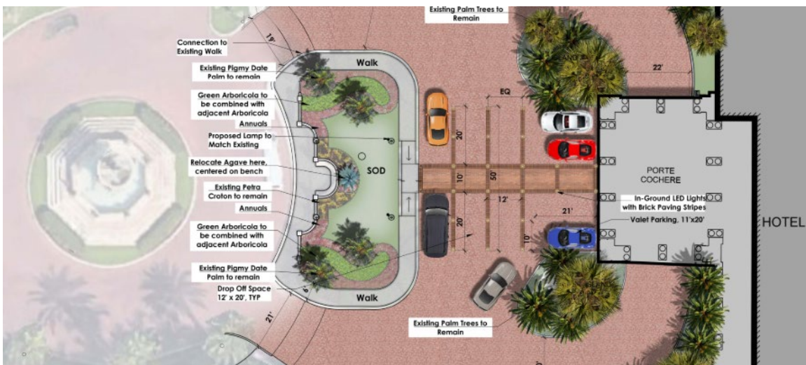
Proposed front drop off area

The new site work will result in a small reduction of green space in the general area of entrance and porte-cochere of approximately 3,637 SF; however, according to the applicant the “green space will be approximately 7,163 SF more than what historically existed in this space prior to the addition of approximately 10,800 SF of landscape space that was added in 2003/2005 with a previous renovation of the front drive.”