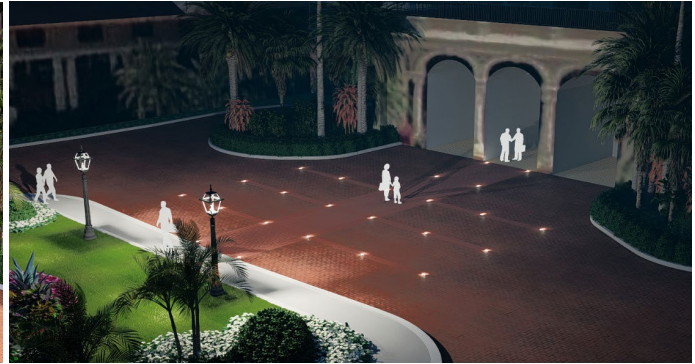
Nighttime rendering of drop-off area

The hotel has made tremendous improvements to this property over the years including the removal of a significant amount of asphalt in the driveway and approach. However, staff has expressed concern about additional lanes and cars obscuring the columns of the Porte Cochere and the loss of green space. LPC will focus on the compatibility for the proposed vertical lanterns and the LED strips imbedded in the paving.