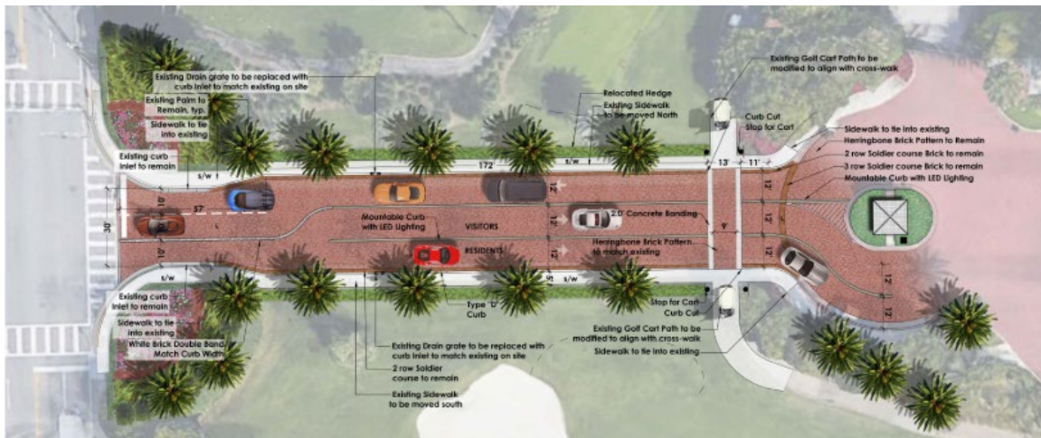
Proposed drive entrance and main drive off S County Road

As is pertains to the drop off front entrance modifications, the proposed pertinent modifications include