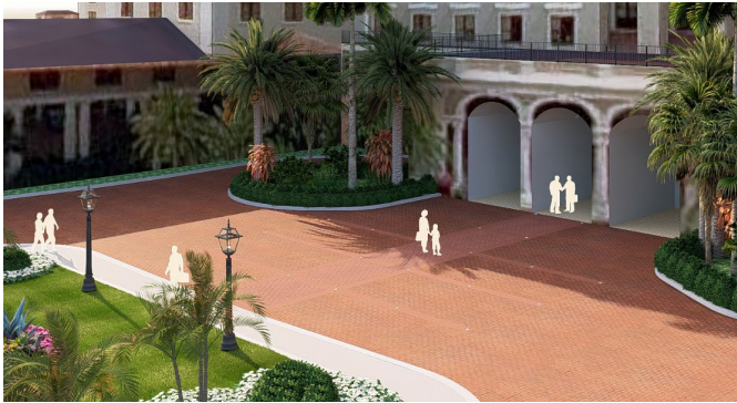
Daytime rendering of drop-off area

The proposed modifications have minimal effect to the overall entry approach, and zero impact on the architecture of the prolific hotel building.