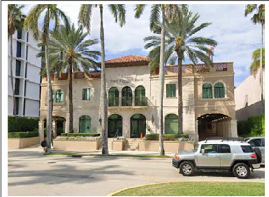
EXISTING SIGN – FIRST REPUBLIC BANK