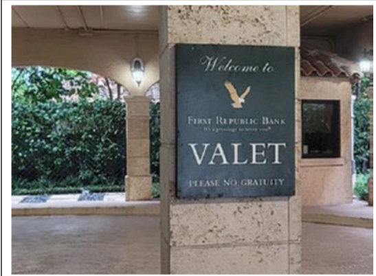
EXISTING SIGN – FIRST REPUBLIC BANK