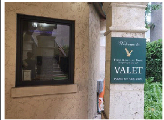
EXISTING SIGN – FIRST REPUBLIC BANK