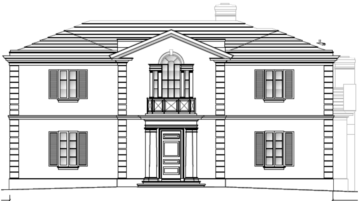
Previously Proposed North Elevation