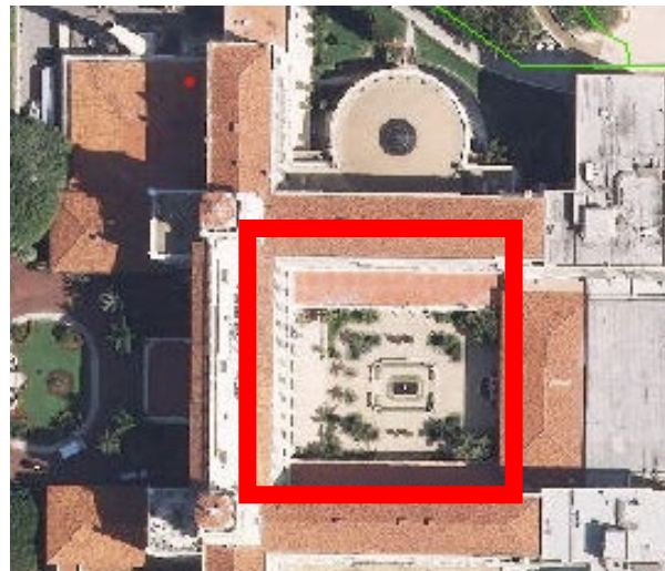
Interior open-air courtyard area under scope of work

The Breakers is a 534 room landmarked hotel situated on 140 acres on the Atlantic Ocean. The resort contains many leisure amenities including an 18-hole golf course, tennis facilities, and eight food and beverage operations within its expansive recreational campus. The proposal is for the construction of a 1,763 SF conservatory addition at the west end of the Breakers interior courtyard and adjacent to the hotel's main lobby and occupying the location of the existing lobby's exterior terrace to accommodate the installation of a small indoor service bar counter (Special Exception #1) and seating area. Additionally, the application seeks to improve the existing open-air courtyard and provide outdoor seating areas (Special Exception #2).