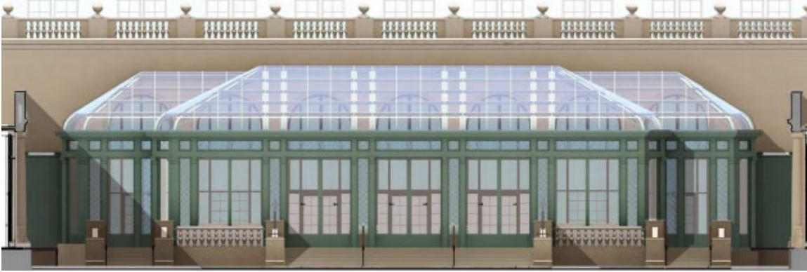
Proposed east façade of courtyard (with conservatory addition)

The fountain and eastern staircase are proposed to be renovated, while the existing steps, landing & balustrades are identified to be removed and replaced, the existing balustrade and lanterns are also noted to be restored. Two new covered pergolas are also being introduced along both of the north and south secondary entrances to the courtyard. New mechanical areas, storage pavilions and an accessibility ramp are also proposed within the courtyard.