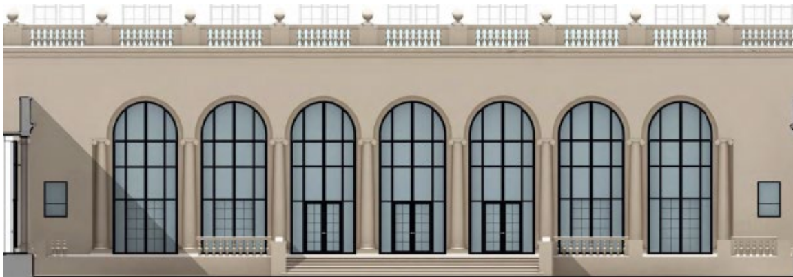
Existing east façade of courtyard

The 1,763 SF conservatory addition at the west end of the Breakers courtyard and adjacent to the hotel's main lobby is proposed to expand the lobby area in order to provide seating opportunities off of the bustling central corridor spine of the Breakers which also serves as the lobby. The addition has been design fully glazed with three sets of sliding doors opening out on the terrace and unto the existing courtyard, proposed to be fully renovated. This new addition will contain a portion of the western raised terraced, configured to interior space and housing the two interior bar counters and seating areas. The new coated metal and glass conservatory will be distinguishable from the main building.